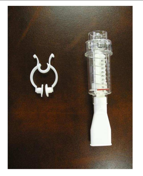
Fig. 1 Pulmonary trainer (Threshold IMT, Philips Respironics, Inc., Murrysville, PA, USA) provides consistent and specific pressure for inspiratory muscle strength and endurance training, regardless of how quickly or slowly patients breathe. This device incorporates a flow-independent one-way valve to ensure consistent resistance and features an adjustable specific pressure setting (in cm H<sub>2</sub>0) to be set by a healthcare professional. When patients inhale through Threshold IMT, a spring-loaded valve provides a resistance that exercises respiratory muscles through conditioning

progression of scoliosis and maintain upright and comfortable sitting balance [1–5, 7, 10, 13, 15–18, 20, 22]. Although many studies have reported the results of scoliosis surgery in patients with DMD, most studies have lacked a postoperative evaluation of the quality of life (QOL) of the patients and the overall effects on the parents. The majority of studies have reported only data on changes in scoliotic curvature and complications. Irreversible changes in cardiac and pulmonary function pose serious risks to anaesthesia and have been relative contraindications to surgery [7, 17, 18, 20, 22, 23].