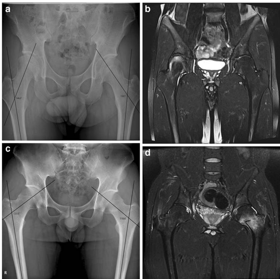
Fig. 1 Representative cases of femoral head and neck stress fractures. In a 21-year-old man, hip anteroposterior (AP) plain radiograph (a) shows a FNSA of 146.0^\circ at the right femur (coxa valga) and the coronal STIR image (b) shows bone marrow edema with a convex fracture line at the right femoral head, representing a subchondral stress fracture. On the contrary, in a 20-year-old man, hip AP plain radiograph (c) shows a FNSA of 118.6^\circ at the left femur (coxa vara) and the coronal STIR image (d) shows bone marrow edema with a fracture line at the left femoral neck, representing a stress fracture

ROC analysis revealed that a FNSA greater than 131.0^\circ represented a potential cut-off value for the prediction of the risk of a femoral head stress fracture, with a sensitivity of 72.7% and a specificity of 68.2% (AUC 0.807, 95% CI 0.680–0.934, p < 0.001 ) (Fig. 2b).