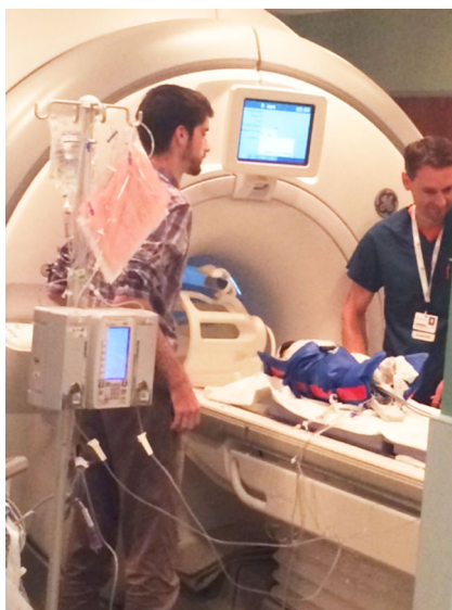
Fig. 2 Photo shows a neonate on the scanner table immediately prior to commencing feed-and-swaddle scan

When attempting to scan neonates using feed and swaddle, noise reduction is crucial. Insert ear plugs and cover ears with noise attenuators, and perform the noisiest sequences at the end of the scan. Additional technical methods to reduce noise, as mentioned previously, include diminished gradient slew rate and slow ramps for k-space readout [14], and even insulation of the inner wall of the magnet's bore [15]. Even the longer-duration neonatal encephalopathy protocol (Table 3), with its greater number of noisier sequences, can be performed with feed and swaddle; motion-degraded sequences are simply repeated until they are of diagnostic quality. In rare situations when severe motion degradation precludes a diagnostic examination, quick consultation with the ordering clinicians during the study to develop a plan for a scan under sedation or repeat feed and swaddle can help minimize unproductive time in the scanner.