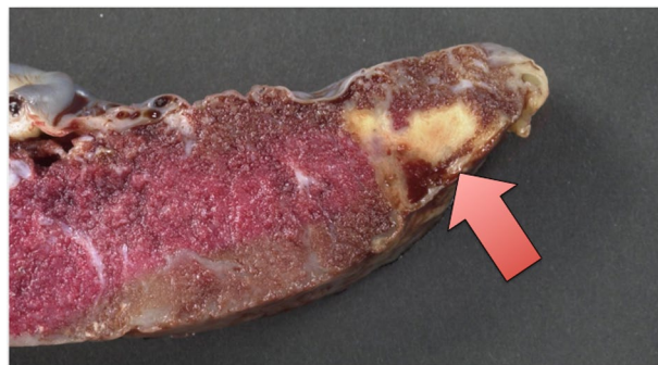
Fig. 2 Placenta from a newborn with hypoplastic left heart syndrome. Arrow points to an area of infarction in the peripheral “vascular watershed” region of the placenta

No significant differences in gestational age at delivery, birth weight or birth weight z score are noted between the different categories of CHD. Differences in the ratios of newborn birth weight to placental weight are present between the groups, with the highest ratio seen in TGA