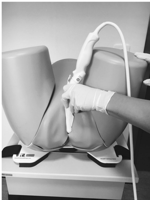
Fig. 1 Measuring the anovaginal distance with a vaginal probe

AVD measurement by transperineal ultrasound was performed in a standardized procedure. The examination was done with the woman in the lithotomy position. The ultrasound machine used was a Voluson Station with a 9–5 MHz vaginal scanner, type E8C. The probe was placed at a right angle to the posterior vaginal distal wall and in a transverse scanning plane, as seen in Fig. 1. The probe was moved cranially in the vagina from the distal to middle level anal canal