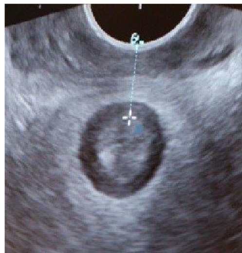
Fig. 2 Perineal ultrasound image of the anovaginal distance measured from the anal mucosa to the posterior vaginal wall

Statistical analysis was undertaken with SPSS Statistics, version 24 (IBM, Armonk, NY, USA). ANOVA statistical methods were used in calculations concerning characteristics of the study population, AVD and external sphincter injury and concerning the AVD and initial palpation thickness. For categorical data, considering maternal and obstetric