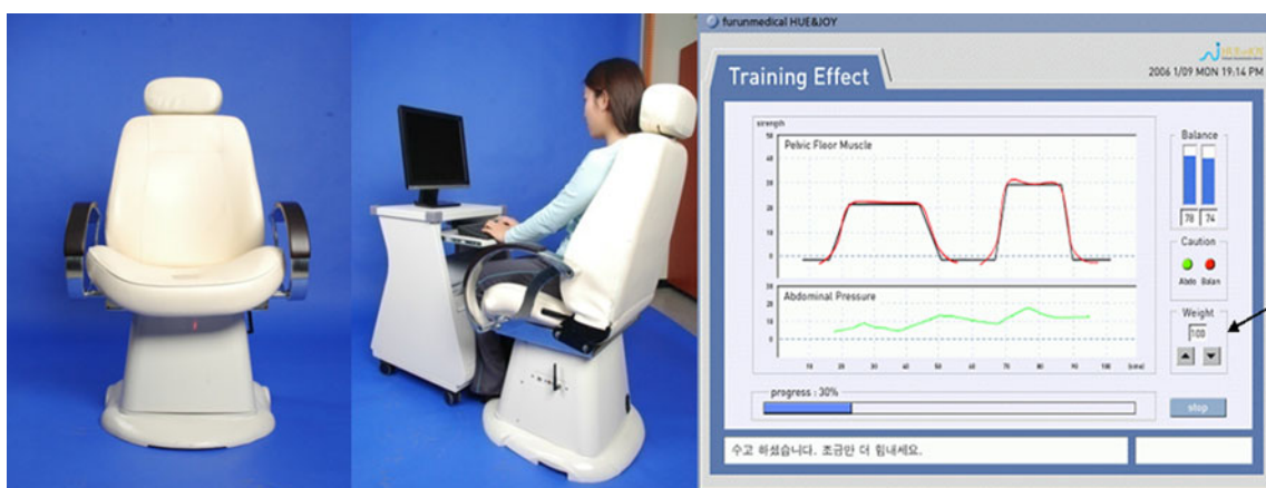
Fig. 2 Extracorporeal biofeedback device. The sensor on the center of the chair puts as much as 10 kg of pressure on the user’s pelvic muscle. Responding to the physical pressure, the user recognizes the pelvic

The strength of the pelvic floor muscles as measured by a perineometer was significantly increased after 12 weeks of PFMT with extracorporeal biofeedback ( p<0.001 ) (Table 2). There was also significant improvement in muscle strength as measured by the Oxford scale after 12 weeks ( p<0.001 ). Incontinence VAS was significantly improved after 12 weeks of treatment compared with baseline (6.5±2.2 at baseline to 3.6±2.4 at 12-week follow-up, p<0.001 ), as were the Sandvik severity index and the incontinence quality of life (I-QoL) questionnaire domains ( p<0.001 ; Table 2).