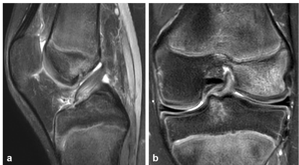
Fig. 1 PDW SPAIR (Proton Density Weighted Spectral Attenuated Inversion Recovery) sagittal (a) and coronal (b) magnetic resonance image of a left knee with a proximal avulsion anterior cruciate ligament tear in a 13-years-old with open growth plates

A custom-made long-leg splint was applied and maintained 4 weeks post-operatively.