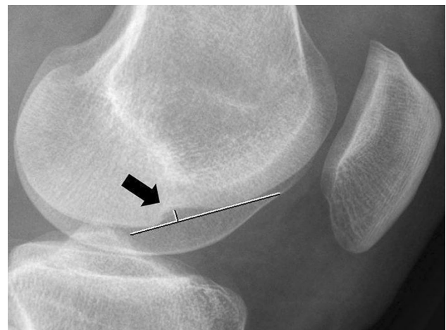
Fig. 1 ACL-deficient knee with a deep lateral femoral notch sign. The depth was measured by drawing a line over the femoral condyle (long line) and a small line perpendicular to this line and the deepest point of the depression (black arrow)