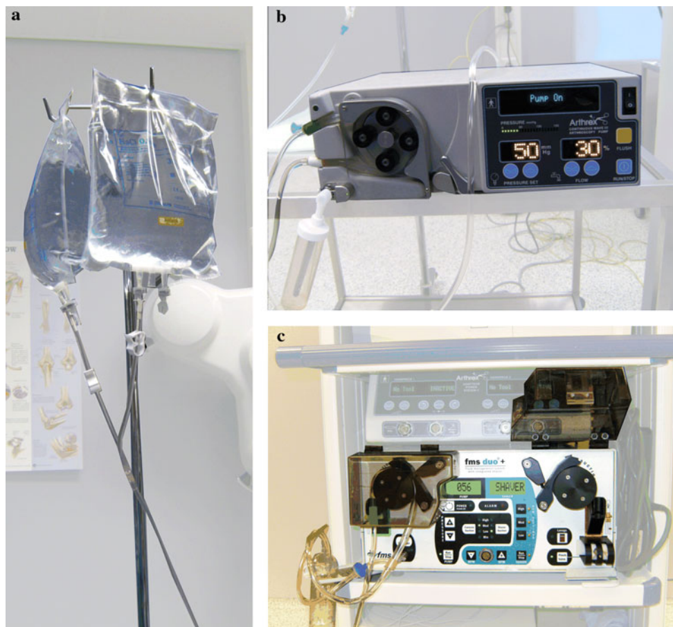
Fig. 1 Three arthroscopic irrigation systems were assessed for their performance with automated blood detection: a gravity infusion, b single roller pump, and c double roller pump. For the gravity

Three different types of irrigation systems were selected for performance evaluation (Fig. 1). The gravity infusion