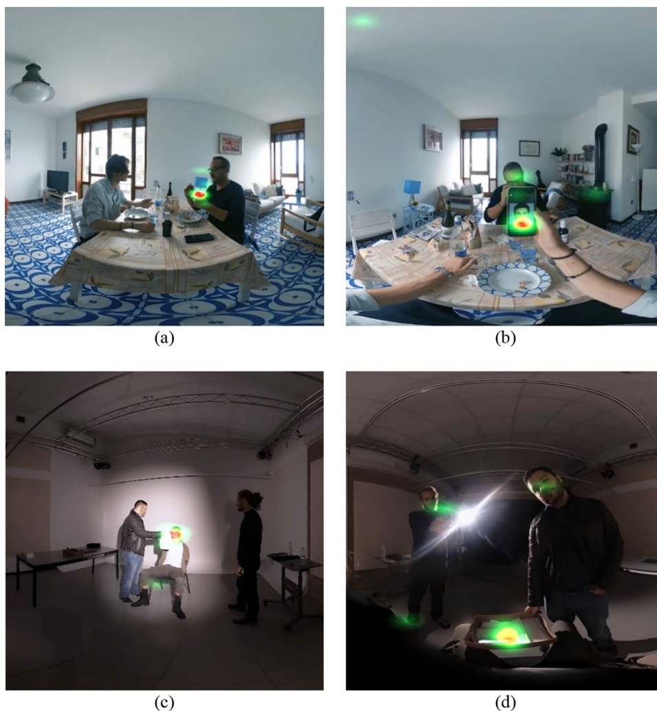
Fig. 2 Examples frames of the heatmaps: a, b “Persons you may know”, and c, d “Oreste is still alive”

(Salvucci and Goldberg 2000). The algorithm considers as a fixation a set of gaze data whose distance is below a certain dispersion threshold with a duration higher than a minimum duration threshold. According to the recommendations given in (Blignaut 2009; Salvucci and Goldberg 2000), in this work the dispersion and the minimum duration thresholds were set to 1^\circ and 100 ms, respectively.