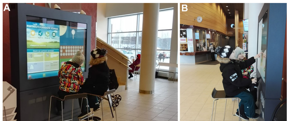
Fig. 1 A public display in use at the swimming center

In this article, we examine the shared, co-constructed cultural values that shape an urban computing project and its outcomes. Therefore, we focus on the developer perspective that we also contrast with the perspectives of other stakeholders. For the study, we view culture through a value lens. The view of culture as values is rooted in a long history in sociology (Weber 1958) and anthropology (Kroeber and Kluckhohn 1952). We adopt a widely accepted, very general definition from Giorgi et al. (2015) that values are “what we prefer, hold dear, or desire” and examine how such values are implicated in an urban computing project and technology. Thus, far, the research community has remained silent about the phenomenon of cultural shaping of urban computing projects and outcomes with a multitude of stakeholders with their own values and interests. Overall, the contribution of this paper is a structured analysis and reflections on cultural issues in community technology design in the wild.