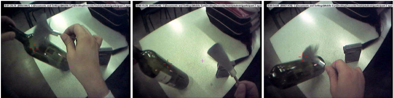
Fig. 3 Dusting for fingerprints

during the visual check phase. Concurrent verbal protocol during the search suggested that the CSE initially concentrated on two areas that were anticipated to reveal marks—and there was an assumption that each area would reveal different types of mark. Around the neck of the bottle, the search was initially for marks from fingertips and thumb holding the bottle vertically (as if carrying it) and around the middle of the bottle the search was for marks of the bottle resting across the middle of the fingers and being controlled by the thumb. Thus, a schema of how the bottle could have been used influenced the initial search.