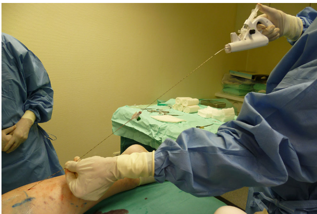
Fig. 3 ▲ Mechanochemical ablation (MOCA)