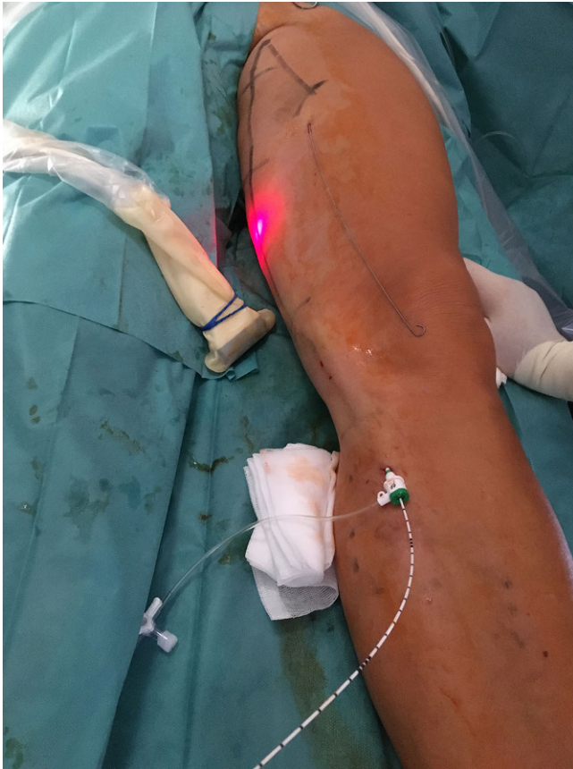
Fig. 6 ▲ Treatment of the great saphenous vein (GSV; probe is inserted in the GSV) and simultaneous treatment of the anterior accessory saphenous vein (wire for cotreatment in the second stage is already inserted)

to the result that in HL+S, significantly fewer saphenofemoral recurrences were revealed by DUS than in EVLA. For these studies it should be known that HL+S was carried out by outstanding surgeons from vein centers with longstanding experience. This is certainly not the general standard in Germany; however, in the early stages of the study, the laser technique was still in its infancy (data collection started in 2004/2005) and was carried out with low wavelengths (810 nm for Rass et al. and 980 nm for Flessenkämper et al.) and bare fibers were used. The laser energy applied in the study by Rass et al. was low and recanalization of the treated saphenous veins often occurred (62% of saphenofemoral recurrences detected by DUS!). In the study by Flessenkämper et al., in which the author of this article also participated (surgical and endovenous procedures), the laser energy was higher but the distance from the bare fibers to the junction