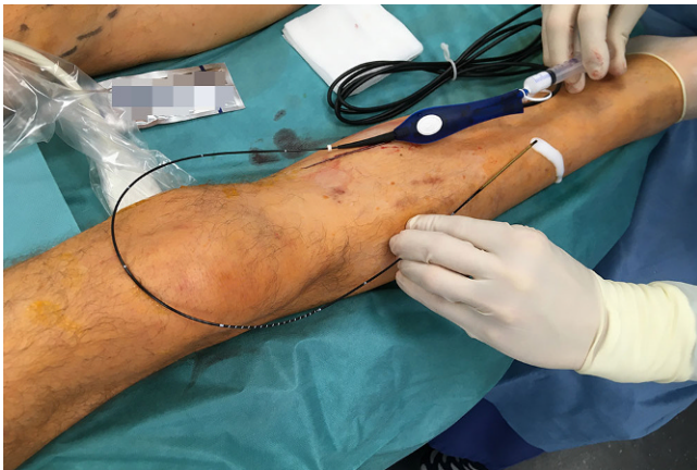
Fig. 1 ▲ Foam sclerotherapy by a segmental radiofrequency ablation (RFA) catheter