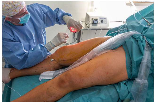
Fig. 2 ▲ Endovenous laser ablation (EVLA) with a radially radiating probe