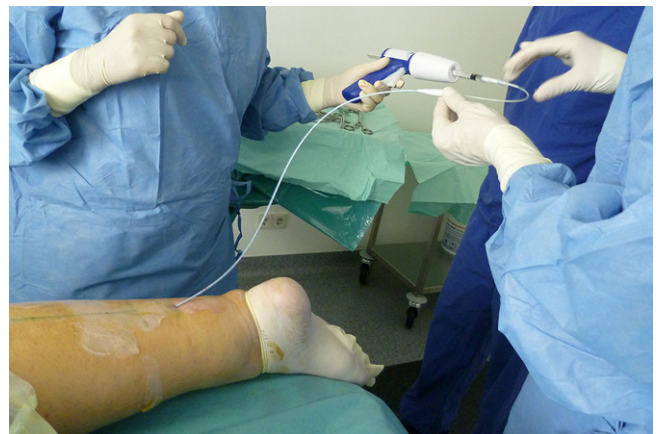
Fig. 4 ▲ Vein adhesive procedure

For laser procedures the tendency is towards wavelengths with a high absorption by water (1470–1940 nm). In this case radially radiating laser probes are preferred (■ Fig. 2), which lead to homogeneous damage of the vein wall. The temperature achieved by a 1470-nm laser with a radial probe is around 120–140 °C ( \pm 20 °C) [12, 13]. With these radial probes, also a saphenofemoral recurrence with a persisting saphenofemoral stump can nowadays be accurately occluded. [10].