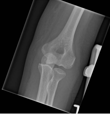
a X-ray of elbow joint with persistent medial luxation and diastasis of ulna and radius.

Fig. 2 Radiological findings of a typical case. Hereby we present a case from a patient with a simple elbow dislocation with persistent luxation after external fixation elsewhere, after a lowenergy trauma caused by a fall on March 8th, 2012. a X-ray of elbow joint with persistent luxation and diastasis of ulna and radius. We removed the static fixator, performed an extended arthrolysis and anatomic reduction of the elbow joint, followed by applying a dynamic hinged elbow fixator on May 15th, 2012 (68 days after trauma), resulting in congruent elbow joint in flexion and extension during surgery. b Intraoperative fluoroscopy images. c Postoperative photo of hinged external fixator. After 8 weeks, the dynamic fixator was removed. d The treatment resulted in a congruent anatomically joint seen on final radiological examination. At last follow-up clinical result was excellent with a flexion-extension arc of 140° and pronation-supination arc of 180°. The postoperative course was uneventful, and the patient was discharged from follow-up after 7.3 months