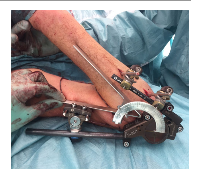
Fig. 1 Orthofix® (Galaxy) elbow fixator

The aim of this study was to investigate the effects of treatment of elbow dislocations with persistent instability using a hinged elbow fixator on the rate of complications and secondary interventions, range of motion, level of pain, and restrictions in activities of daily living. The study was performed in a medical center in which the majority of patients