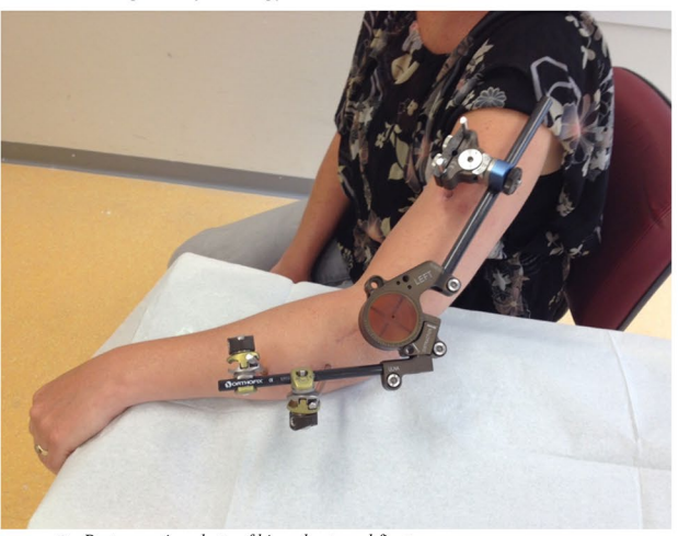
c Postoperative photo of hinged external fixator.