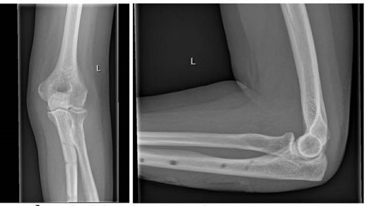
d Final radiological examination showing a congruent joint.