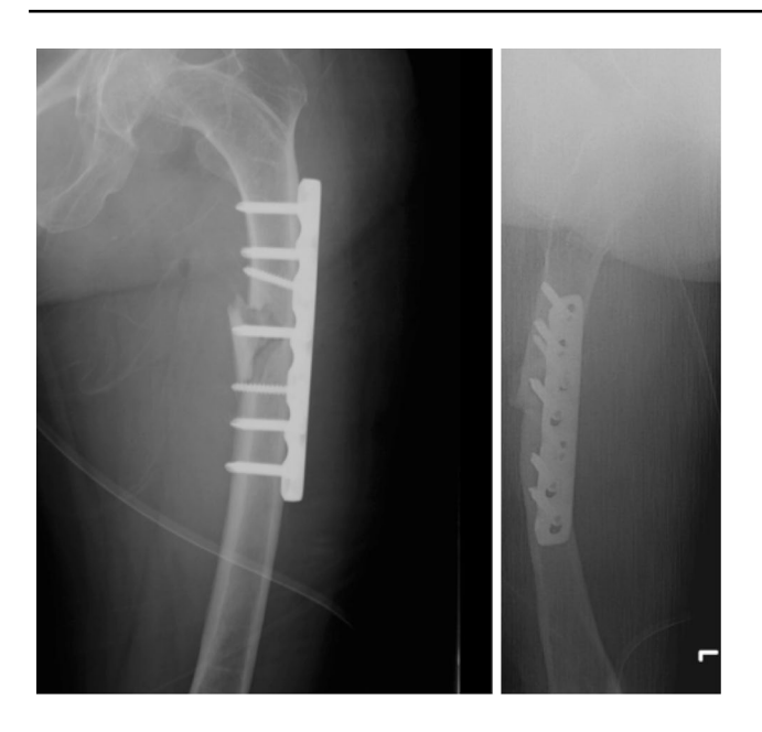
Fig. 3 An open reduction internal fixation using a Locking Compression Plate (LCP 7 holes) was performed in February 2011

a 10–14 year period [18, 19]. However, these number of subjects are small and the results could presumably not be extrapolated to adults, whereas non-OI adults have a 7.3 times higher non-union rate compared to non-OI children [20].