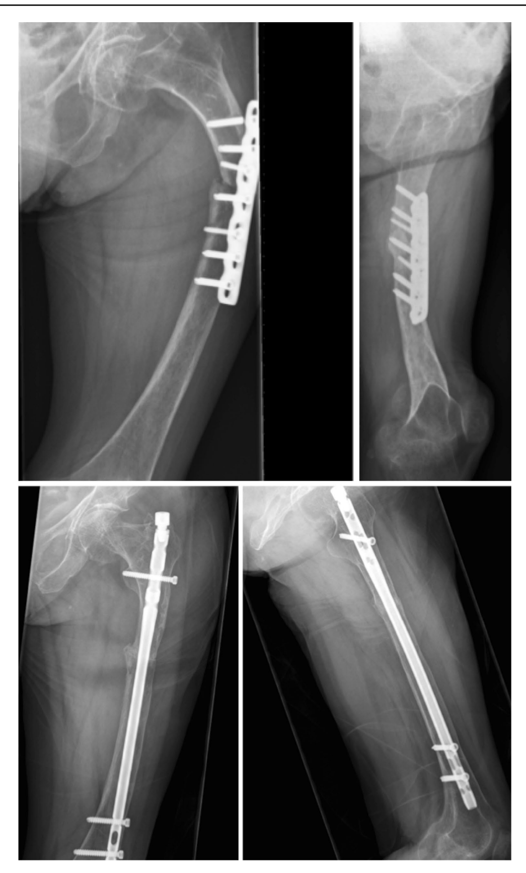
Figs. 4–5 Follow-up in September 2012 showed pseudoarthrosis. Pseudoarthrosis repair was performed in November 2012 using an intramedulary femoral nail (T2) combined with wedge excision for correcting varus deformity. The nail was mobilized in April 2013, resulting in union