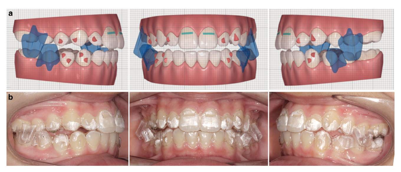
Fig. 2 Frontal and lateral views of a mandibular advancement (MA) appliance: a Clin-check plan and b intraoral view Abb. 2 Frontale und laterale Ansichten einer Unterkiefervorschubapparatur (MA): a Clin-Check-Plan und b intraorale Ansicht

the first permanent molars, and 0.030-inch ball clasps (or arrow clasps) were positioned in the interproximal spaces anteriorly. The precise clasp arrangement depended on the state of the dentition at the moment of TB construction. In the mandibular arch, Clark suggested placing ball hooks in the interproximal areas between the canines and incisors [18].