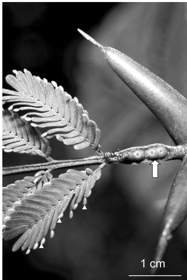
Fig. 1 Food bodies of Acacia collinsii . The food bodies (FBs, or "Beltian bodies") of myrmecophytic Acacia species are modified leaflet tips produced at every young, unfolding leaf of an inhabited plant ( \Delta ). FBs are collected by the ants and carried into the hollow thorns, where they most probably are fed to the ants' larvae. Extrafloral nectar is secreted by enlarged nectaries ( \uparrow ) on the petiole

Here we focus on the three main nutrient classes in plant-derived cellular ant rewards. Ant-acacias (also called "swollen thorn" acacias) occur both in Africa and in Central America, and apparently all acacia-ants live in enlarged, hollow stipular thorns and feed on extrafloral nectar secreted by foliar nectaries as a source of carbohydrates and water (Janzen 1974; Young et al. 1997; Raine et al. 2002). However, food bodies (FBs, "Beltian bodies", see Fig. 1) are produced only by the Central American ant-acacias (Janzen 1974). These FBs are modified leaflet tips (Rickson 1969), which are harvested by the ants and fed to their larvae (Janzen 1974). The acacia-ants form a group of ten closely related species described as Pseudomyrmex ferrugineus – group (Ward 1993). Each plant species can be inhabited by different ant species, ants of the P. ferrugineus group and their host acacias have obviously experienced diffuse coevolution