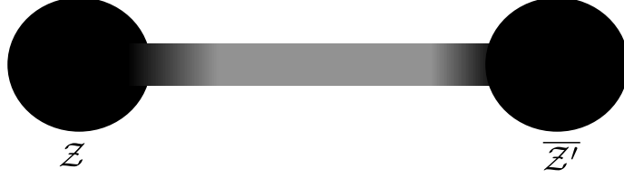
Figure 2. Gluing of two mildly noncompact SQFTs \mathcal{Z} and \mathcal{Z}' . The orientation of \mathcal{Z}' is reversed to \overline{\mathcal{Z}'} .

By gluing \mathcal{Z} and \mathcal{Z}' , we obtain a compact SQFT \mathcal{Z}'' . Now we claim that the index I_{\mathcal{Z}}(q) satisfies the gluing law