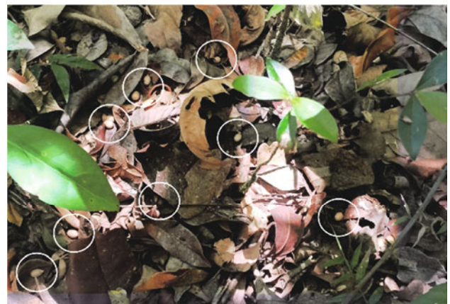
Figure 5. Regurgitated seeds accumulated under a nest of the Helmeted Manakin Antilophia galeata . Some of the more than 100 seeds found were highlighted by a white circle.

Our bibliographic review revealed 10 nests of the species previously reported in the literature, two of them