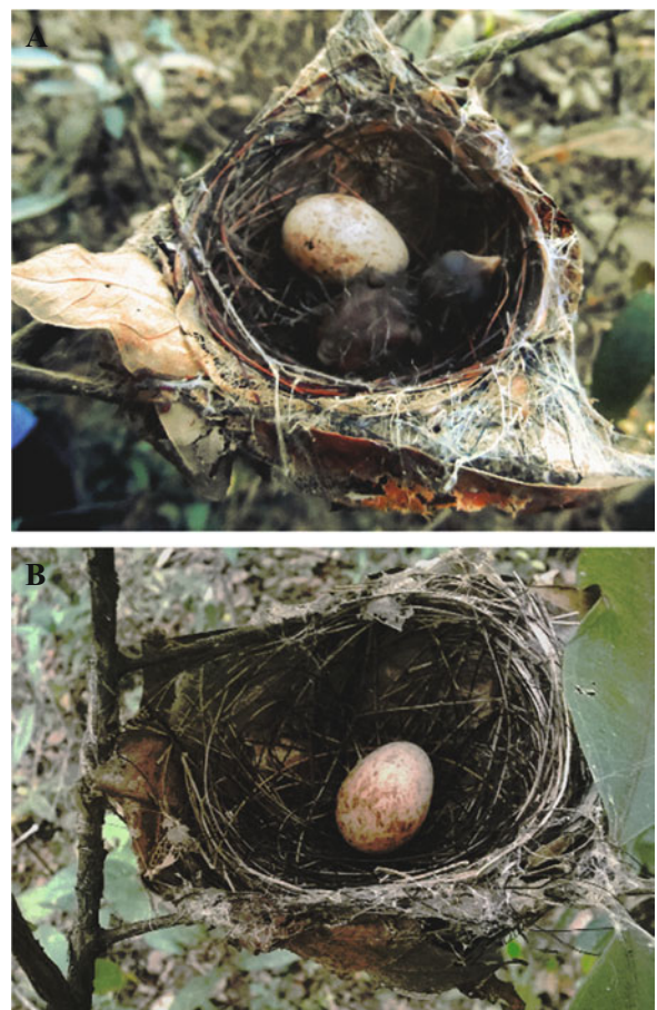
Figure 3. The nest of the Helmeted Manakin Antilophia galeata with an egg and a freshly hatched nestling. Nests of this species are a cup attached by its top lip in the angle of a forked branch (A). Nest constructed between two nearby parallel branches, evidencing the presence of leaf petioles and some unidentified vegetable fibers in the inner layer of the structural zone (B).