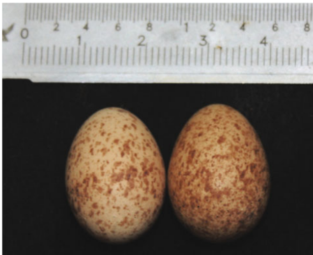
Figure 4. Two eggs of the Helmeted Manakin Antilophia galeata belonging to the same clutch. Note the marked chromatic differences between them.

Renesting after loss of a first clutch is common, and at least three breeding attempts in a single breeding season have been recorded, as indicated by indirect evidence. One of the banded females monitored was seen carrying material to construct its nest at the last