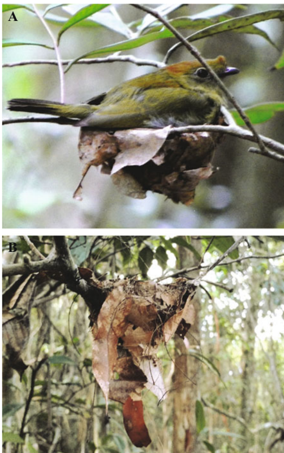
Figure 2. Female Helmeted Manakin Antilophia galeata incubating its eggs (A). Note that the crest, nape and back of this bird is slightly washed with red, what suggests that it is an old female, as previously reported for the species (Marini 1989) and members of Chiroxiphia (Kirwan & Green 2011). Side view of another nest, showing a long tail made of dry leaves, leaf petioles, and horsehair fungus hanging on its outer walls and lower part (B).

Spider silk was collected within a radius of ~100 m from the construction site, as suggested by the several observations of females collecting material for nest construction. At each visit in which she brings material, the female sits in the unfinished nest and, with the wings held close to the body, she makes circular movements in the nest, shaping it with her legs while compressing the nest material with her breast and flanks. The female then perches on the edge of the nest and arranges the leaves and petioles with its beak, sits again in the nest and compresses and shapes the newly added material