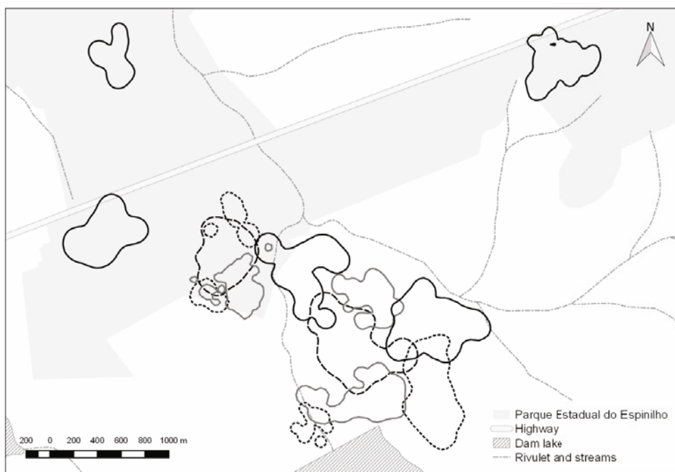
Figure 2. Distribution of home ranges (polygons) of 13 breeding pairs of Yellow Cardinal ( Gubernatrix cristata ), in the municipality of Barra do Quaraí, state of Rio Grande do Sul, Brazil. Shaded area represents the protected area of Espinhalho State Park. Polygon lines (grey, continuous black, dotted, dashed) are only for visual differentiation purposes.

Mean estimated breeding territory size was 17.9 \pm 5.6 ha (11.9–28.4 ha; n = 9 ). Mean home range size was 27.7 \pm 9.1 ha (14.5–41.9 ha; n = 9 ; Figure 2). Breeding territories were relatively stable and defended year-round. A yearling female was marked in October 2013 and found later paired with a male two territories away from her natal territory in November 2013. The mean distance between simultaneous nests of different breeding pairs/territories was 443 \pm 155 m (215–628 m; n = 6 ).