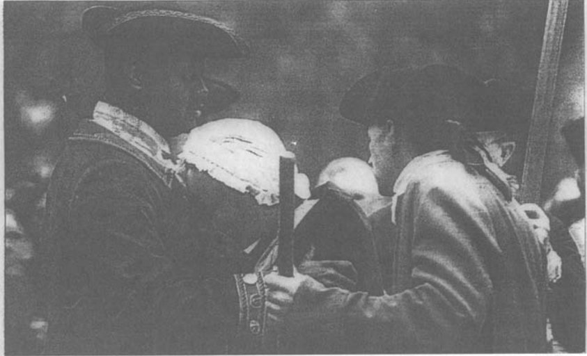
FIGURE 3. "CW auctions slaves."

The re-enactment itself went smoothly, without any of the