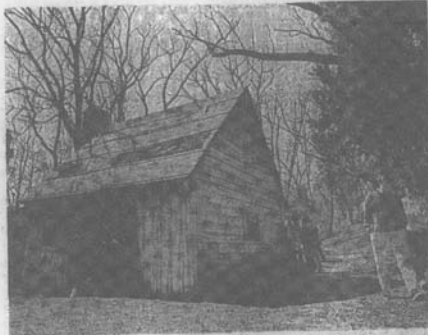
Visitors to the Sotterley plantation in St. Mary's County pass the cabin.

Many of those descendants gathered today at Sotterley, on the wide banks of the Patuxent River, to begin an effort to raise more than half the $73,000 that preservationists estimate it will cost to restore the slave quarter. The Sotterley Mansion Foundation has applied for a $27,000 state grant but must raise the rest in matching funds; $10,000 already has been spent on a site study.