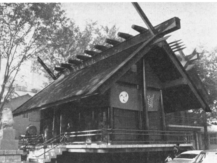
New market for CorTen? The Japanese steel salesman may have opened a new market for CorTen steel in shrines.

The new gauge has a maximum error of 1% in the case of steel 90mm or less in thickness, and 2% for steel 90mm ~ 120mm thick. It measures the thicknesses of wide flange beams during rolling, and feeds the measured results back to the rolling process. It uses five curies of cesium 137 with detectors placed at a distance of one meter from the gamma ray source. The radioactive rays which pass through the steel are converted into electric current to measure the thickness.