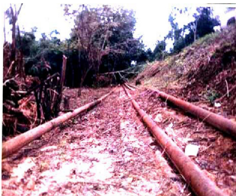
Fig. 3: A section of the study area showing the topography of middle slope and bottom slope soil types with overlying oil pipelines