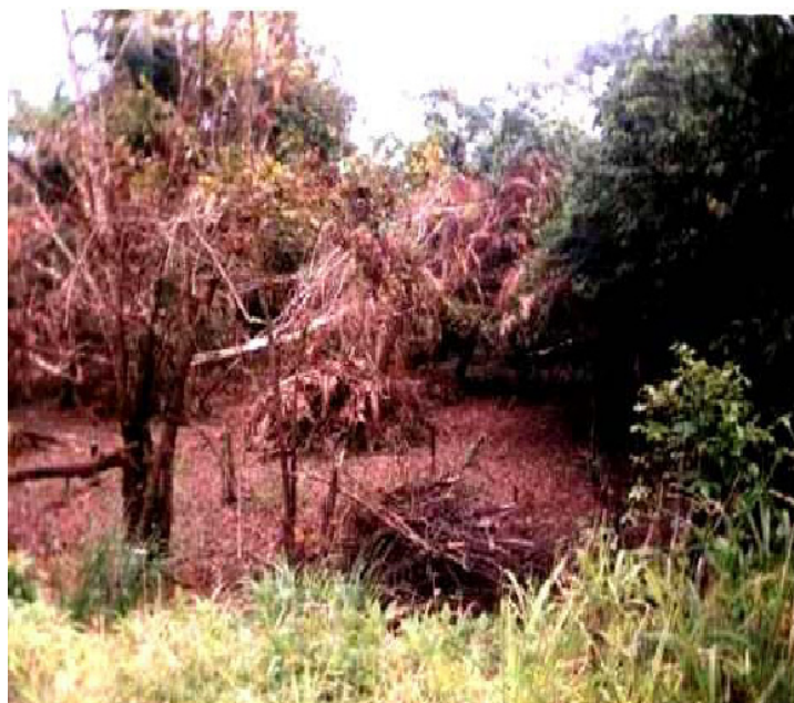
Fig. 4: A close-up view of the oil-affected and unaffected areas showing scanty vegetation, defoliated mangroves and other seeming toxicological and pathological symptoms