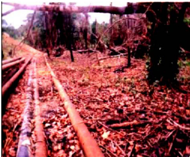
Fig. 2: A section of the study site showing pipelines, mangrove litters and felled tree forms within the right of way