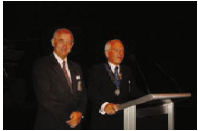
Fig. 15. First address of Mr. B. Pekkari (Sweden) as new President of IIW.