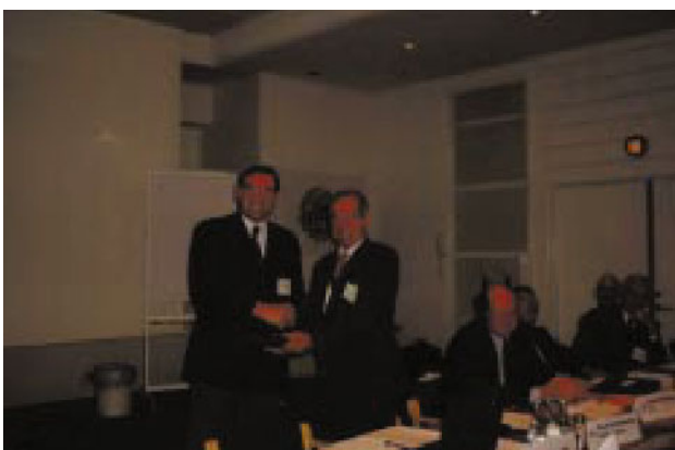
Fig. 10. Prof.-Dr. D. von Hofe (Germany).