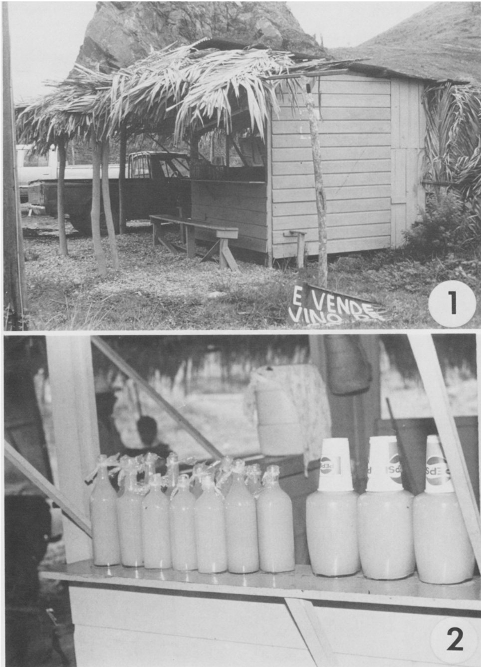
Fig. 1-2. Coyol wine. Fig. 1. "Vino de coyol" stand where fermented sap of Acrocomia mexicana is sold. Fig. 2. Bottles of "vino de coyol."