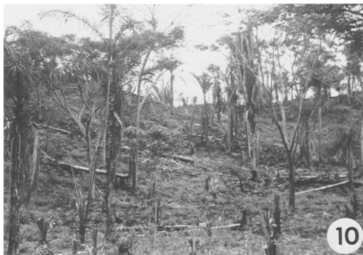
Fig. 10. Field of Acrocomia mexicana where tapping for wine production occurs; note the palm stems cut to produce coyol sap.