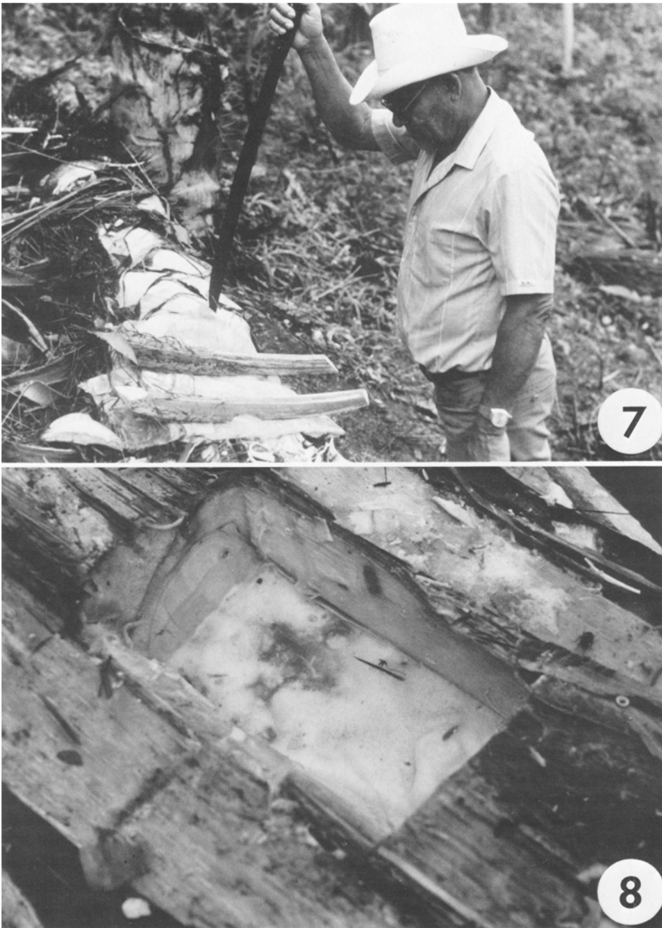
Fig. 7-8. Coyol wine. Fig. 7. A plastic sheet is used to cover the trough and keep contaminants out of the sap during wine production. Fig. 8. Foamy sap fills the crownshaft trough several times each day.