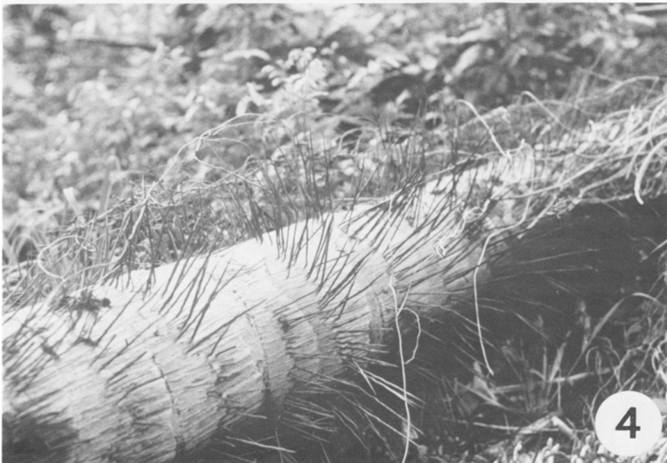
Fig. 3-4. Coyol wine. Fig. 3. Cleaning the area around a fallen coyol tree to facilitate harvest for wine production. Fig. 4. Trunk spines of Acrocomia mexicana that must be removed prior to tapping.