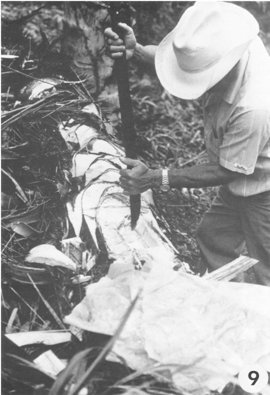
Fig. 9. Coyol wine. Shaving off a few millimeters from one side of the trough to keep the sap flowing from the vessels during wine production.