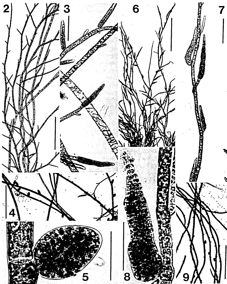
Figs 2-9. Ectocarpus siliculosus . Gametophytes and parthenosporophytes Figs 2-3. Female gametophyte from Naples. 2 Habit (scale bar 0.5 mm); 3 Gametangia (scale bar 100 \mu m) Figs 4-5. Female partheno-sporophyte from Naples. 4 Habit (scale bar 0.5 mm). Unilocular sporangium (scale bar 50 \mu m) Figs 6-8. Female gametophyte from Chile. 6 Habit (scale bar 0.5 mm). 7 Gametangia (scale bar 100 \mu m); 8 Gametangium (scale bar 50 \mu m) Fig. 9. Male parthenosporophyte (scale bar 0.5 mm)