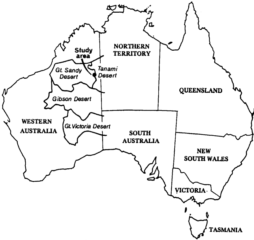
Fig. 1. Location of study area.

nal people and describing the various methods of procurement and processing. An assessment is made of the nutritional contribution and importance of various key food stuffs.