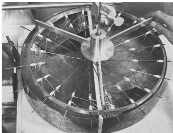
Fig. 2. The original prototype of the Ni-Ti solid-state heat engine on the first day of operation: August 8, 1973

ported by spokes which radiate from a crankshaft somewhat offset from the center of rotation of the wheel and which extend outwards through its periphery. This system is similar to the configuration of an airplane engine where radially disposed pistons communicate to an eccentric crankshaft that is normally caused to rotate by forces exerted through the pistons. In the Banks Engine the force of pistons is replaced by the force of Nitinol wires straining to open from a looped U-shape to their “remembered” straight shape. The mechanical force thus generated will tend to turn the crankshaft or, equally, to turn the wheel if the crankshaft is held stationary, as is the case in the prototype. Rotation of the wheel advances the position of the wire loops which fall alternately into semi-circular baths of hot and cold water placed immediately beneath the machine.