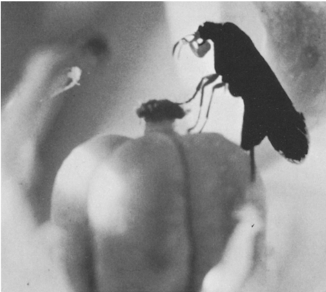
Fig. 1. Female T. maculata ovipositing in a developing Yucca whipplei seed pod

the moths to predation or accidental death. There may also be circumstances in which the dispersing moths are unable to locate another inflorescence and are thus prevented from reproducing any further.