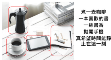
Fig. 1. Display of coffee book and tablet in black and white color style.

Research materials were taken from online coffee resources, and subjects were placed in a cafe environment through text descriptions. Different environmental elements and coffee cup colors were used to assess how they affect mood and coffee perception. Figures 1 and 2 presented two different atmospheres, cool and warm, and identified areas of interest including coffee, coffee pots, tablets, books, and coffee cups of different sizes, blue cups, water cups, and desserts (Figs. 3 and 4).