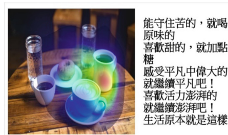
Fig. 4. The heat map of eye movement analysis in Fig. 2.