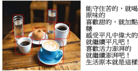
Fig. 2. Display coffee, water glasses and bread in a wood tone color scheme.