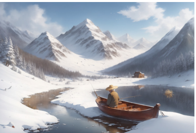
干山鸟飞绝 万径人踪灭 孤舟蓑笠翁 独钓寒江雪

autumn, sunset, calm, serene, mountains, water, flying, lone, duck, vivid colors