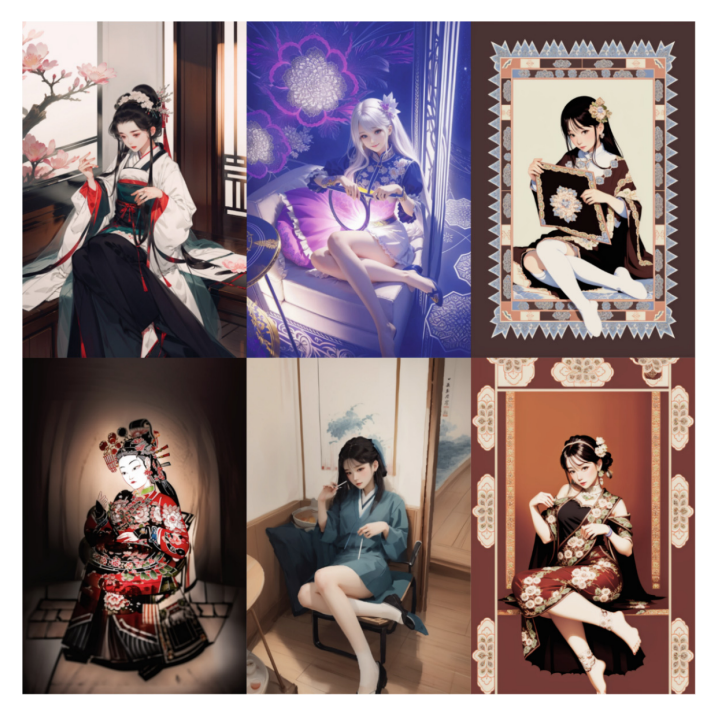
Fig. 5. Images generated with our method.