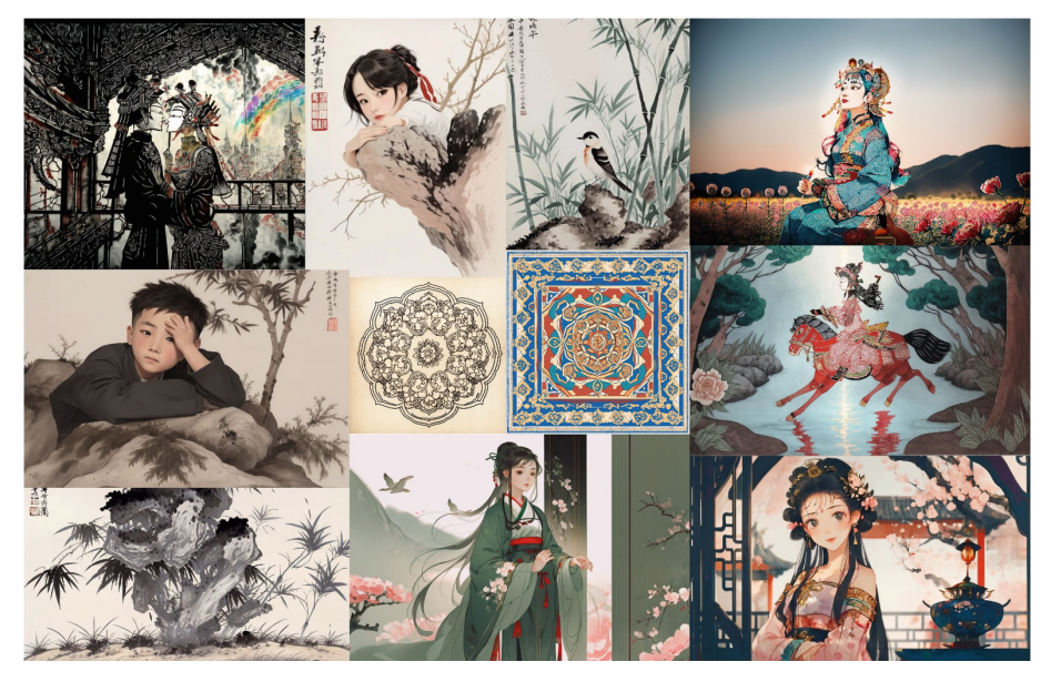
Fig. 3. Images featuring Chinese culture generated by our method.