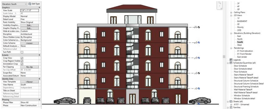
Fig. 1. Developed model on revit with exterior finishing

This study suggested a method for urban mining that is based on the process of classifying data from different dimensions. A case study building was constructed using Autodesk Revit 2019 as the BIM authoring tool to establish the model shown in Fig. 1.