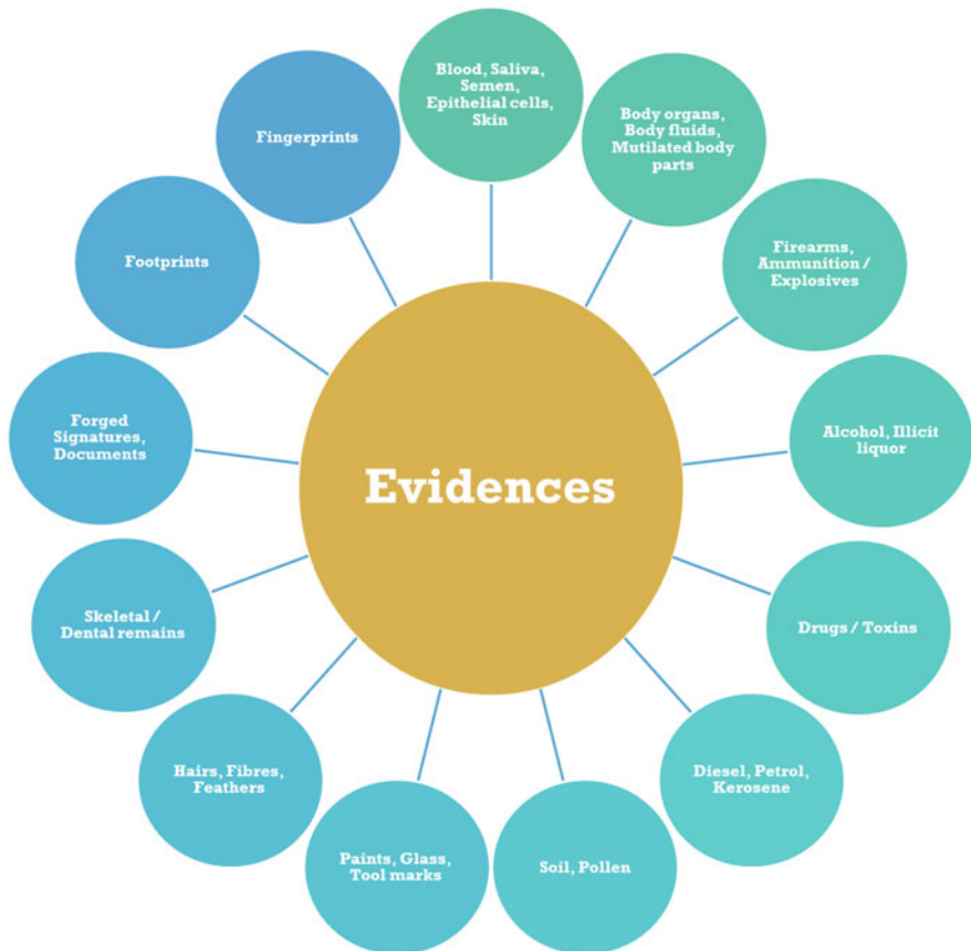
Fig. 2.2 Some evidence that may be encountered at an offence scene

Every crime scene is unique and may present unique objects or materials as evidence. However, it is imperative to be aware of the list of potential evidence that