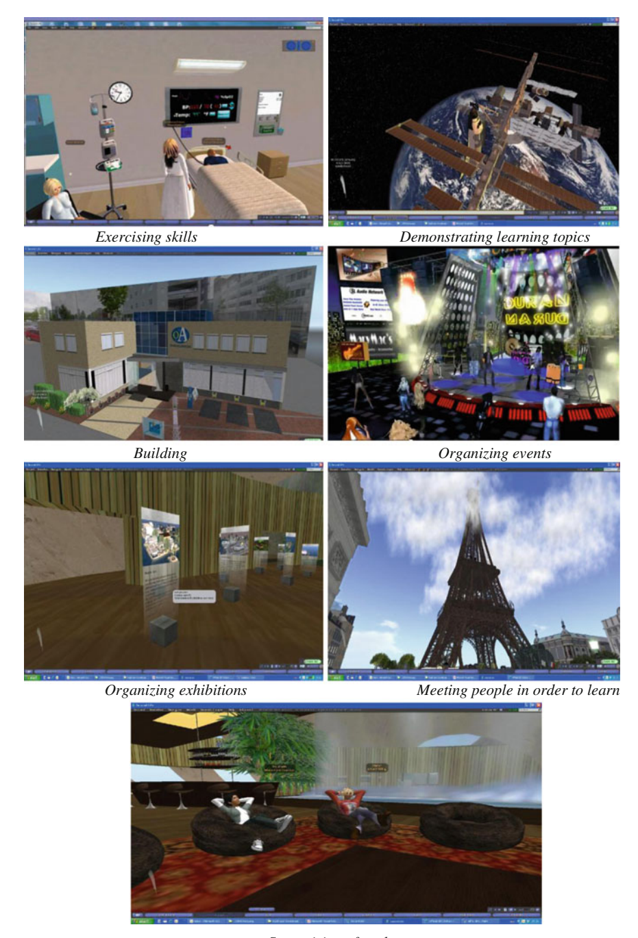
Supervision of students