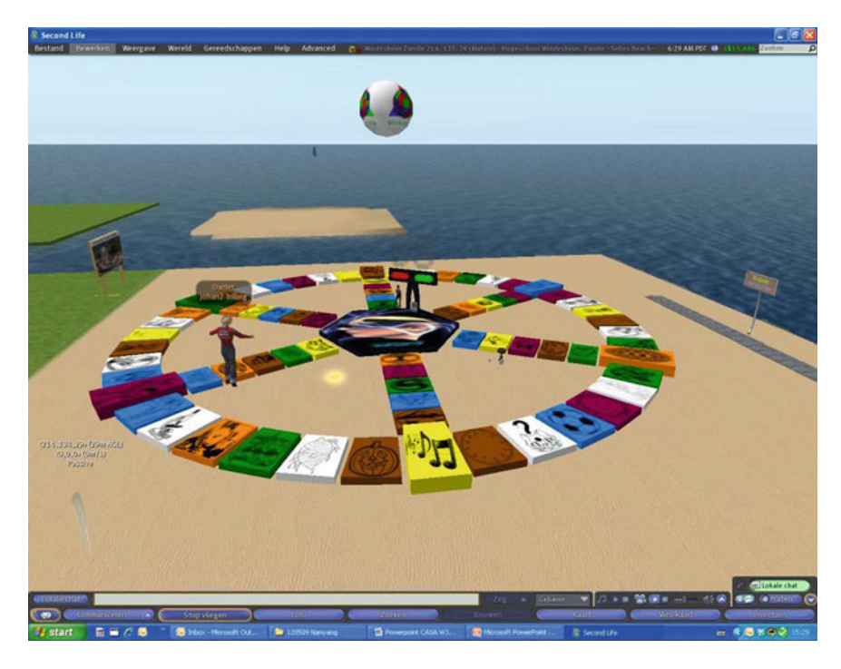
Fig. 3 The serious game 3D-trivial pursuit with exam questions

education, where traditionally communication is asynchronous. The number of students included in this study was to small (n = 16) to report on grades.