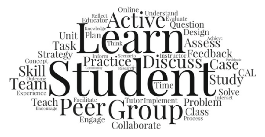
Fig. 13.1 Representative keywords characterising the research around collaborative active learning

thematic analysis of the authors' ideas and understandings. We present this as a conceptual framework in the following section.