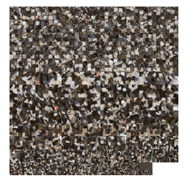
Fig. 5 167 Texture obtained from the data of photographs