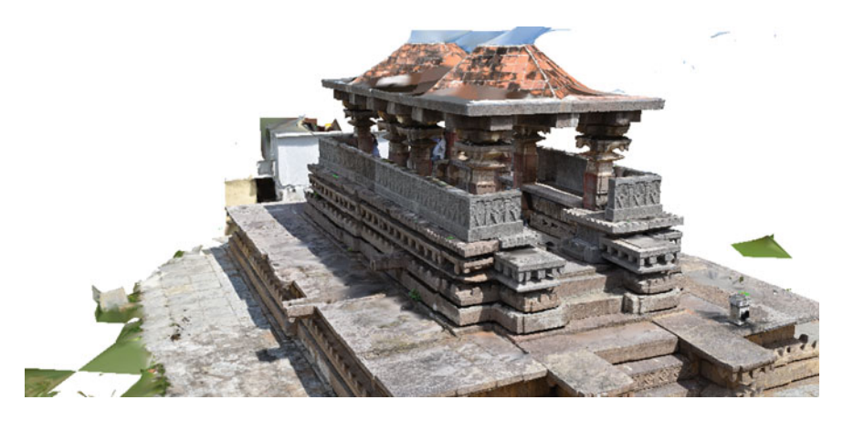
Fig. 2 Raw data (Textured) obtained after uploading to reality capture

The final product is available in two formats: basic and dense model. The dense model mesh comprises 72.5 million triangles, whereas the simple model mesh is