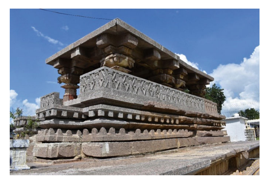
Fig. 1 Nandi Mandapa of Kashi Vishweshwar Temple, Kalabgoor

Reality Capture software was used to rebuild the 3D model using the raw data acquired realistically as shown in Figs. 2 and 3. This software was used as it provides additional tools to enhance the texture. The software aligns the photos that are obtained. In the event of any discrepancies, the images were aligned manually using a reference point.