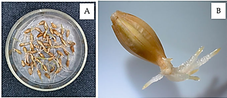
Fig. 6.2 Photos of Barley seeds: (a) barley seeds were treated with Selenium nanoparticulate in a Petri dish; (b) only one germinated Hordeum seed (Siddiqui et al. 2021)

formulation of SeNPs at a dose of 4.65 g/mL had the highest percentage of seed germination (Siddiqui et al. 2021) (Fig. 6.2).