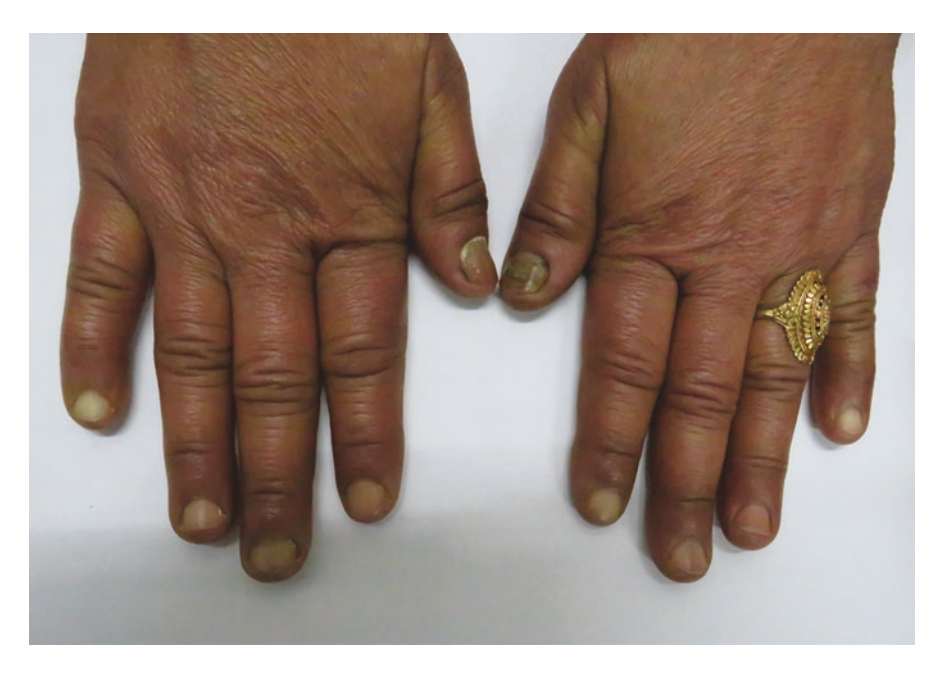
Fig. 21.6 Sensitive hands due to frequent handwashing during the COVID-19 pandemic