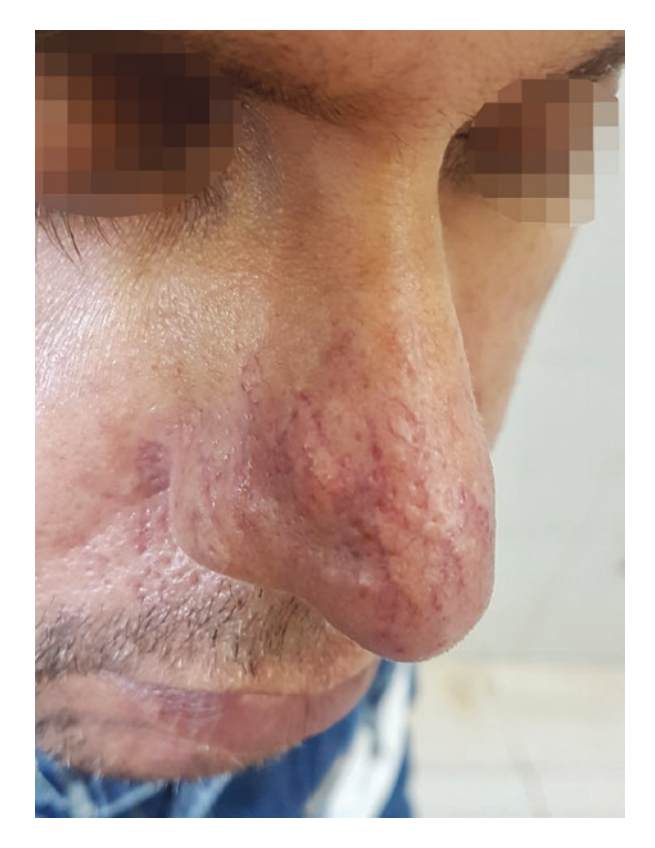
Fig. 21.4 Erythematotelangiectatic rosacea on the nose showing telangiectasias and persistent erythema

they cause breach in continuity of skin and lead to sensitization and exacerbation of sensitive skin [5].