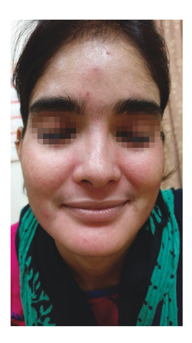
Fig. 21.2 Topical tretinoin induced sensitive skin