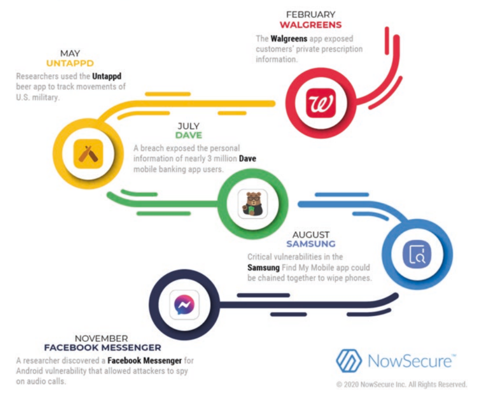
Fig. 8.2 Mobile app security and privacy issues plague top brands in 2020.

evaluations, 85% of public app store apps have cybersecurity problems, and 70% leak private data (Schurr, 2020). The following are five notable mobile app security and privacy concerns in 2020 as a consequence of a vulnerability, hack, or data leak (Fig. 8.2).