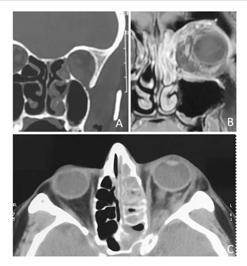
Fig. 11.1 Radiological features of rhino-orbital mucormycosis: ( A ) shows the CT scan of a patient showing a patchy hyperdensity involving the left ethmoid sinus and nasal cavity (turbinates), with adjacent edema of the left medial and inferior recti. ( B ) shows the CEMRI orbit and paranasal sinuses of another patient. This T1 weighted image shows patchy enhancement of the ethmoid sinus and adjacent infero-medial orbital involvement. The enlargement of inflamed nasal turbinates is also noted. ( C ) shows a heterogenous opacity involving the entire left ethmoid sinus. There is predominant left orbital apex involvement seen as a heterogenous hyderdensity at the apex, involving the medial rectus, the optic nerve sheath and surrounding fat