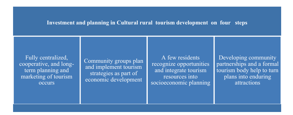
Fig. 15.3 Stages in cultural rural tourism development.

more challenging and less advantageous industry for the majority population in India, agri-tourism brought out the quality outcome. On the other hand, the practical knowledge of improving socio-economic status can be the best example to Bangladesh by advancing agri-tourism.