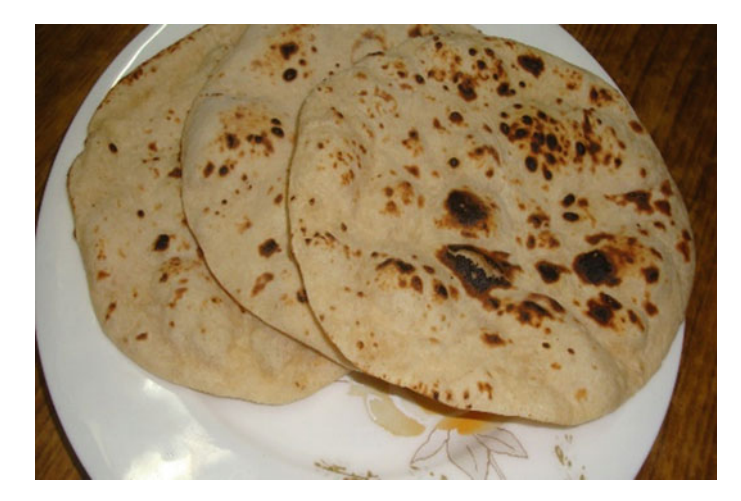
Fig. 3 Photo of Indian bread

Another approach that could be helpful is the DocFace implementation presented in [15] and [16] which involves mapping of student's identity with their face. A combination of transfer learning and using a domain-specific dataset of ID-Selfie pairs helps in building a robust facial recognition module. This is very critical for sufficient supply of meals to the students registered for the scheme.