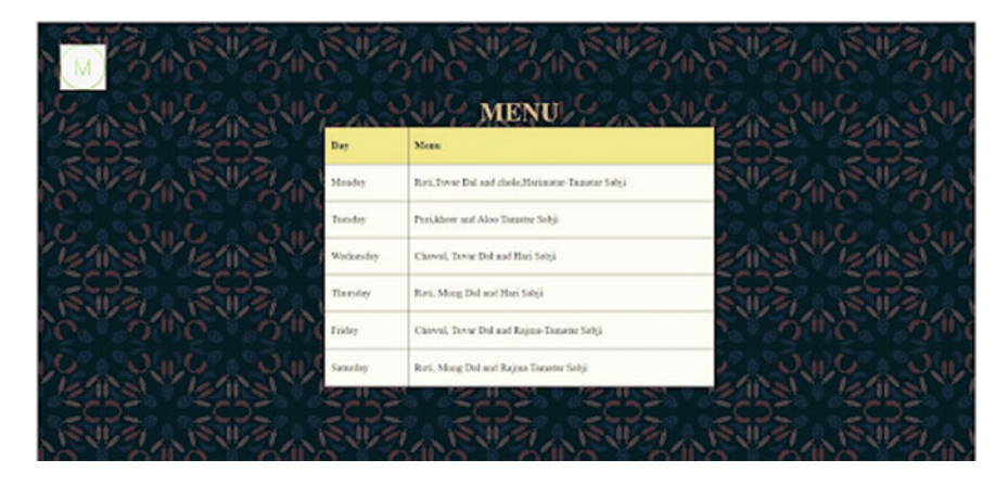
Fig. 7 Dynamic updation of weekly menu on website

Table 1 As reported by peerreviewers at g2.com, businesssoftware and services review