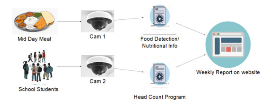
Fig. 2 Block diagram of our proposed system