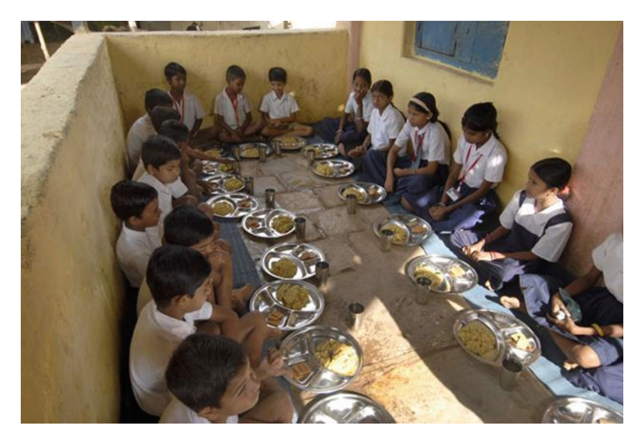
Fig. 1 School students having food under midday meal scheme

If we look at the scope of error causing these pitfalls, it is clear that there is a lot of potential for improvement. Unhygienic food could also result in food losing its nutritional value. Our proposed method uses third party Application program interface for detecting the food and obtaining the calorie count of the food from the image of the food. The food detection algorithm is trained on Indian food. This can