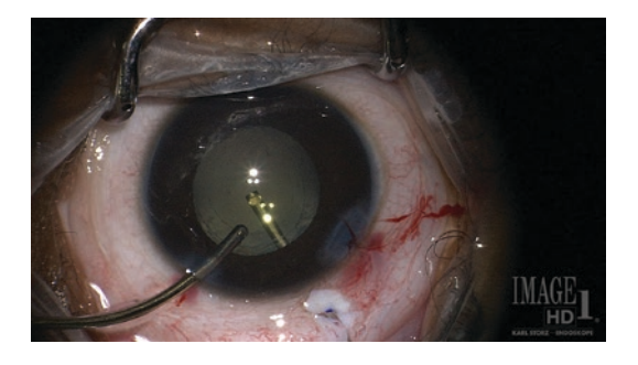
Fig. 6.1 To reduce the incidence of PCO or VAO, a pars plana posterior capsulotomy is being done after IOL insertion in this 12-month-old child

Indications, risk factors and the rate of an unanticipated return to the operating room within 3 months of pediatric cataract-related intraocular surgery has been reported recently [7]. The