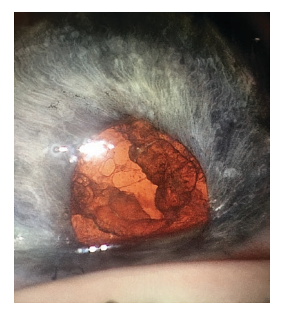
Fig. 6.3 Visual axis opacification in an eye with an immature iris and synechia

that VAO was more common in pseudophakic (32%) than aphakic (8%) eyes (P = 0.009) in infants operated for bilateral cataract surgery [11]. In addition to age at surgery, the type of IOL used may also be a risk factor for developing a secondary opacification after cataract surgery. Different types of IOLs may have different lengths of time until opacification. For example, secondary opacification formed more quickly when PMMA lenses were implanted compared to acrylic lenses [12]. Eyes with traumatic cataract are more likely to develop PCO as compared to eyes without traumatic cataract [13]. If PCO does develop, YAG laser capsulectomy or surgical membranectomy can be performed [9].