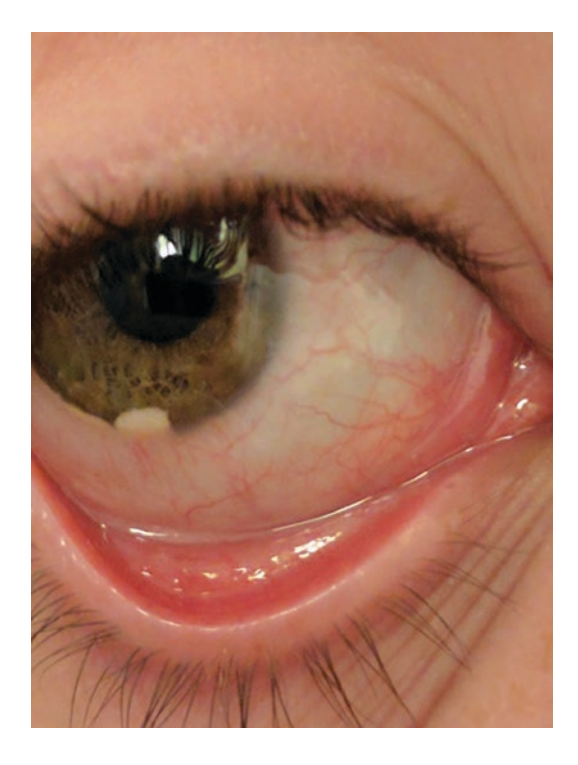
Fig. 6.4 Intracameral triamcinolone persisting in the inferior portion of the anterior chamber at 1 week after surgery

Triamcinolone disappears from the anterior chamber in most eye within days after surgery, however, it may persist, especially if it reaches the vitreous cavity (Fig. 6.4). We don't leave