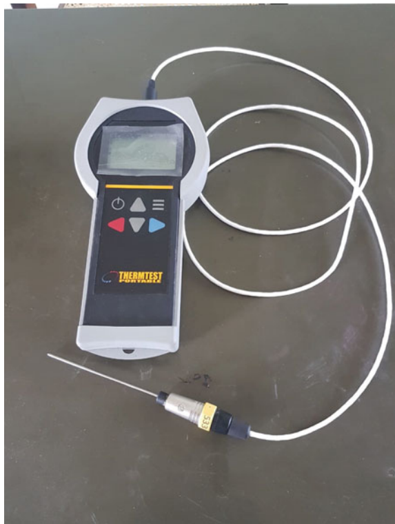
Fig. 5 Thermal resistivity meter

Thermal conductivity of specimens is measured as per ASTM D5334 using portable thermal resistivity meter. Photograph of thermal resistivity meter is shown in Fig. 5. The thermal conductivity values of specimens are shown in Table 5. Thermal conductivity decreases with the increase in proportion of soil and this is due to the thermal insulation characteristics of clay in its dry state. However for both the soils specimens with 20% soil exhibits higher thermal conductivity than that of ordinary foamed concrete specimen. As per IS 3346 (2004), thermal conductivity of foamed concrete varies from 0.53 to 0.63 W/mK as the density ranges from 1400 to 1800 kg/m 3 . However for the same density of soil-based foamed concrete the thermal conductivity values are much lesser.