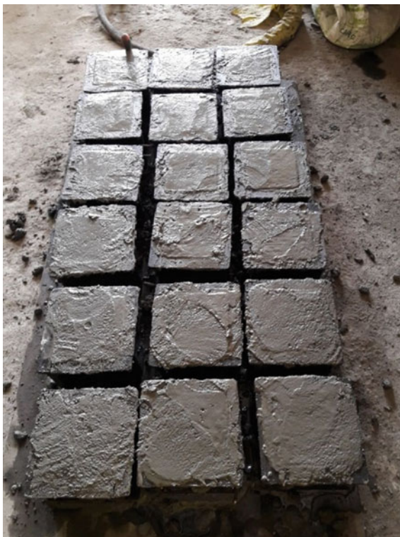
Table 2 Mix ratio