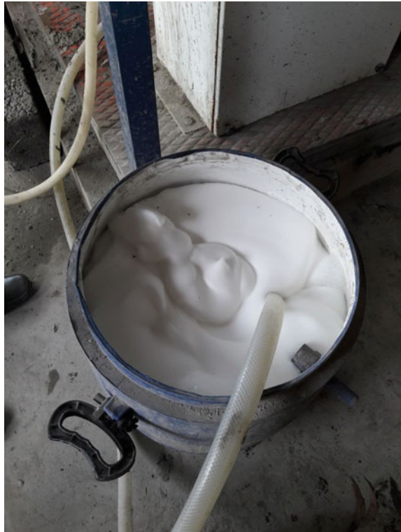
Fig. 1 Foam

Nandi et al. (2016) discuss the procedures for preparing foamed concrete specimens. Cement and soil were mixed in dry state. Foam is prepared by adding 30 ml foaming agent in 1000 ml of water and the mix is then agitated mechanically. 0.4 \text{ m}^3 of foam was added for every 1 \text{ m}^3 of concrete. Photograph of foam is shown in Fig. 1. The water-cement ratio was fixed as 0.55 for obtaining a good consistency for the concrete. Foam is added during the wet mixing of concrete. Cube specimens of size 15 \times 15 \times 15 \text{ cm} were prepared and water cured for 7 and 28 days. Photograph of samples prepared is shown in Fig. 2. Seven different mixes were used by varying the type and proportion of clay used as mentioned in Table 2. The cured specimens were tested for density, compressive strength, water absorption, and thermal conductivity.