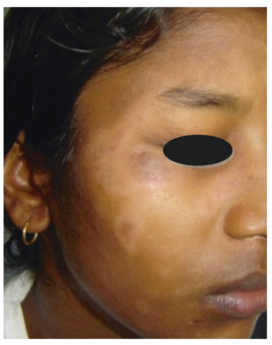
Fig. 10.4 PLE in a 13-year-old girl. These lesions were itchy and eczematous