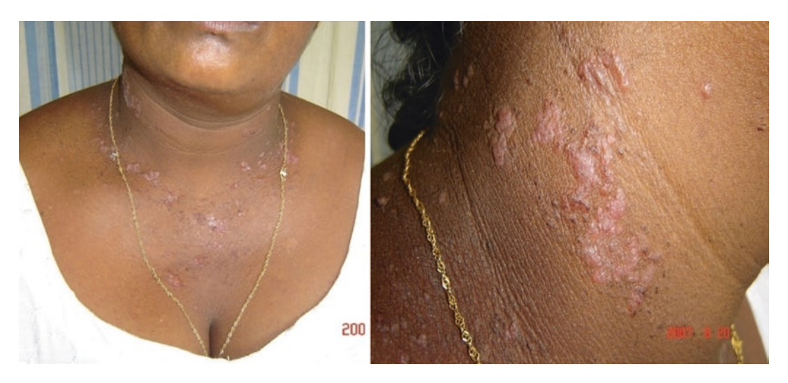
Fig. 10.10 Polymorphic light eruption. Acute vesicular type, following acute severe sunburn