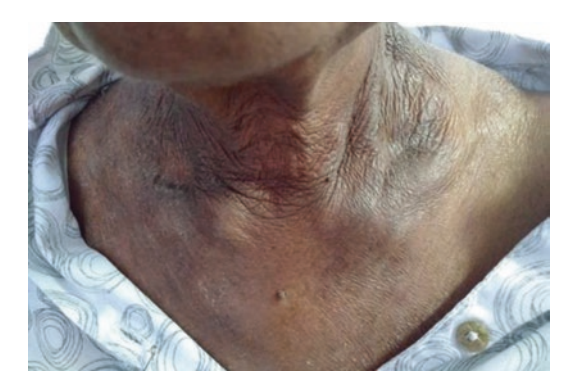
Fig. 10.28 Photoaggravated dermatitis pellagra