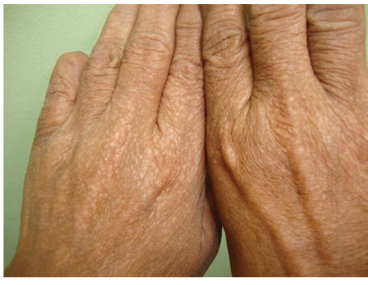
Fig. 10.12 Polymorphic light eruption. Hypopigmented papules and plaques. These lesions are permanent and accumulative over the time unless strict sun avoidance is practiced which is not practical in a tropical country. Fortunately this PLE type is not common in Sri Lanka.