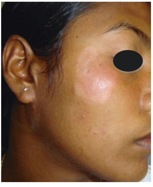
Fig. 10.5 PLE is sometimes erythematous on sun exposure