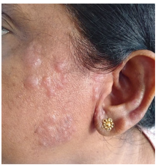
Fig. 10.19 Solar urticaria