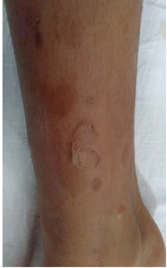
Fig. 10.29 Photoaggravated dermatitis porokeratosis