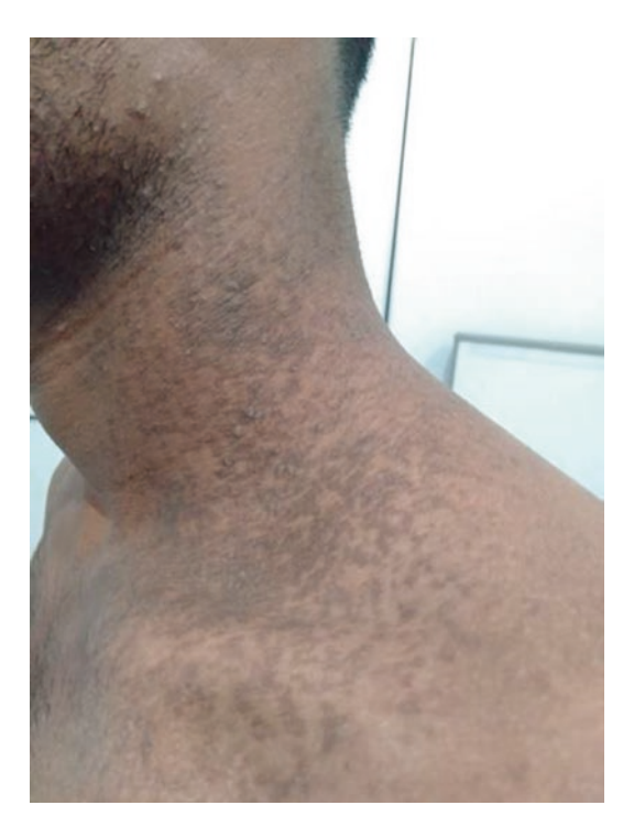
Fig. 10.37 Photoaggravated dermatitis Darier's disease