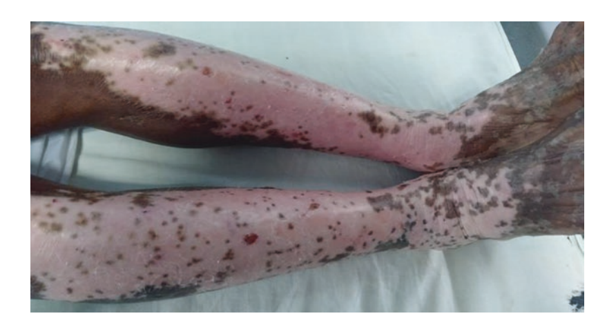
Fig. 10.33 Photoaggravated dermatitis vitiligo