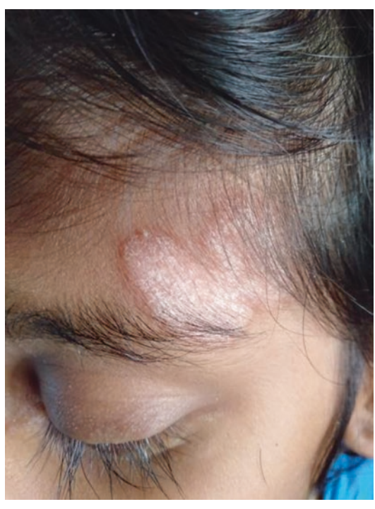
Fig. 10.32 Photoaggravated dermatitis psoriasis