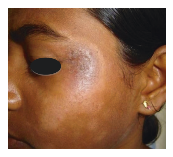
Fig. 10.7 Polymorphic light eruption. Itchy hypopigmented rash on the face in a 15-year-old girl. Secondary "eczematization" develops particularly in atopic persons if itching persists