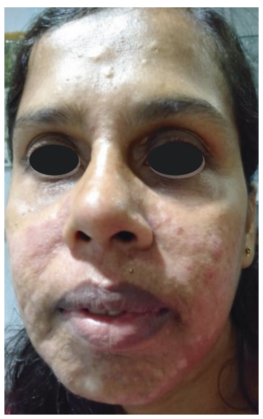
Fig. 10.25 Photoaggravated dermatitis pityriasis rosea