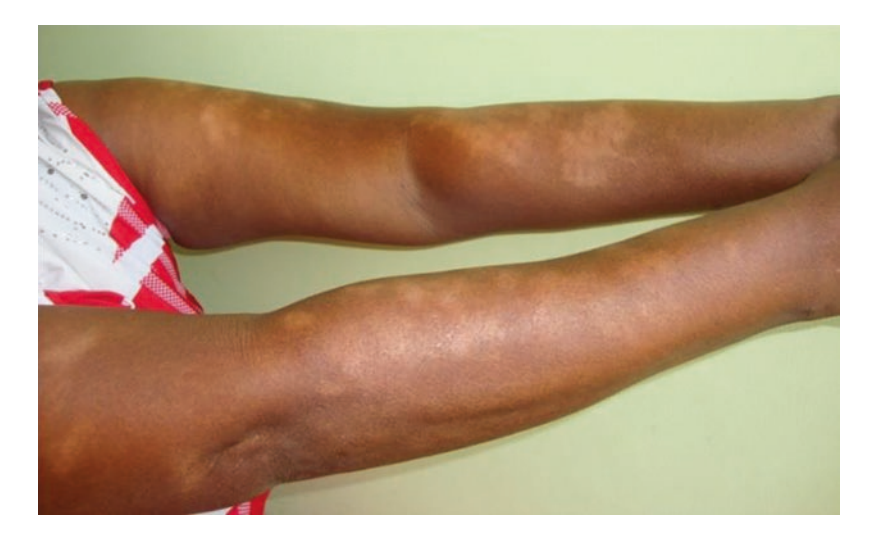
Fig. 10.6 Polymorphic light eruption. Note hypopigmented macules are confined to extensor aspect of upper limbs. Flexure aspect is spared