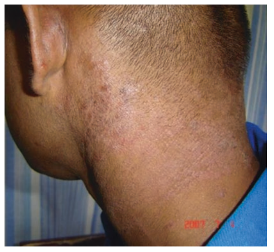
Fig. 10.8 Polymorphic light eruption. Chronic eczematous type

Hydroxychloroquine, ciclosporin, mycophenolate mofetil, hydroxycarbamide, etretinate, danazol, thioguanine, topical nitrogen mustard, thalidomide, infliximab, and INF- \alpha have been reported to be effective but only in small case series and case reports (Paek and Lim 2014; Ibbotson and Dawe 2016).