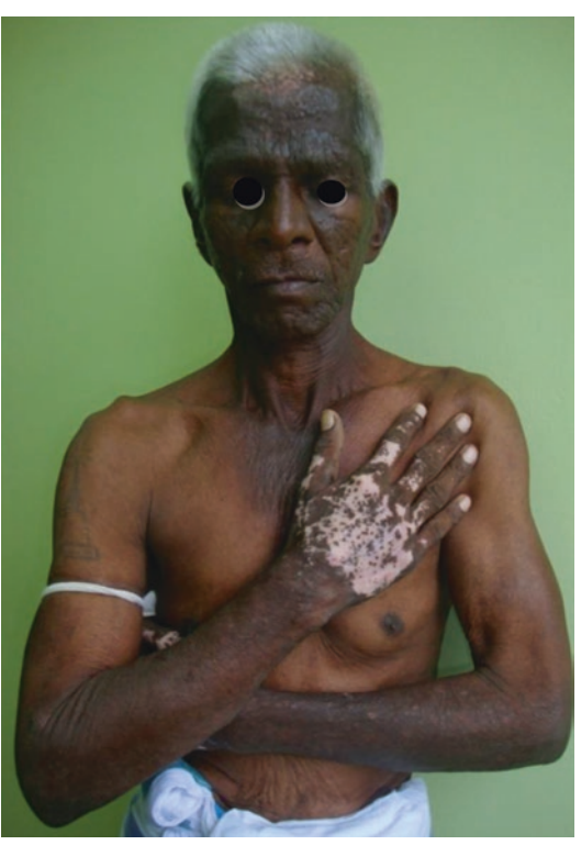
Fig. 10.15 Chronic actinic dermatitis in a 76 year-old man. Note lesions are clearly demarcated to sun exposed areas of the body