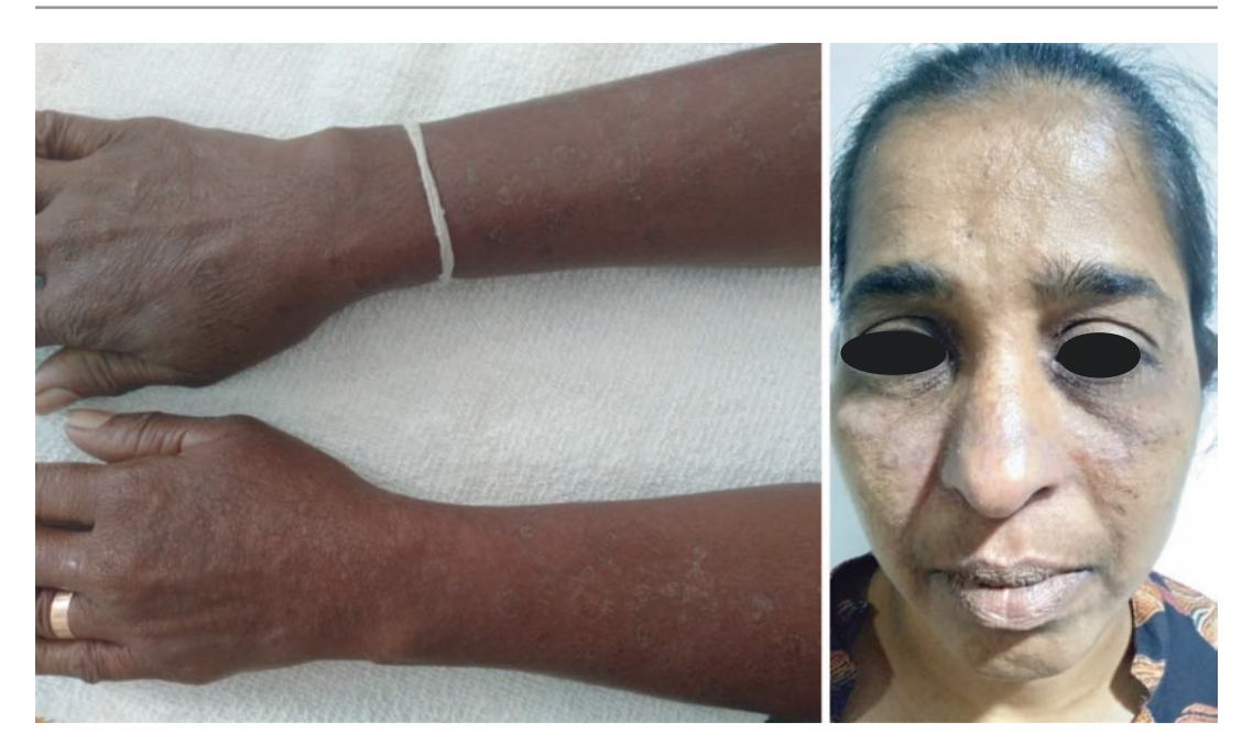
Fig. 10.39 Phytophotodermatitis induced by washing with herbal remedies