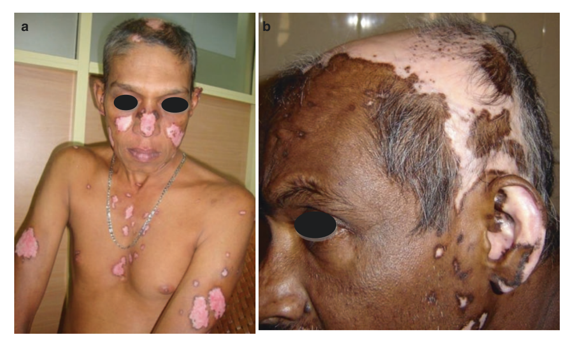
Fig. 10.35 (a and b) Photoaggravated dermatitis discoid lupus erythematosus. Note DLE lesions are confined to sunexposed areas including the scalp