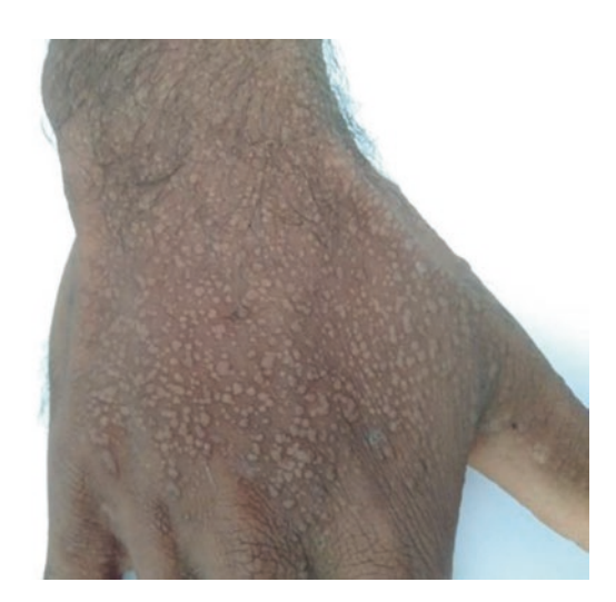
Fig. 10.23 Photoaggravated dermatitis lichen nitidus