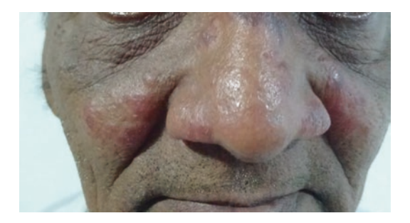
Fig. 10.27 Photoaggravated dermatitis rosacea