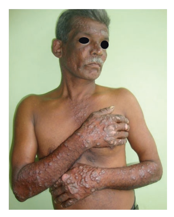
Fig. 10.16 Chronic actinic dermatitis in a 45 year-old manual laborer. A nodular prurigo-like morphology. Note the skin lesions are strictly limited to sunlight exposed areas