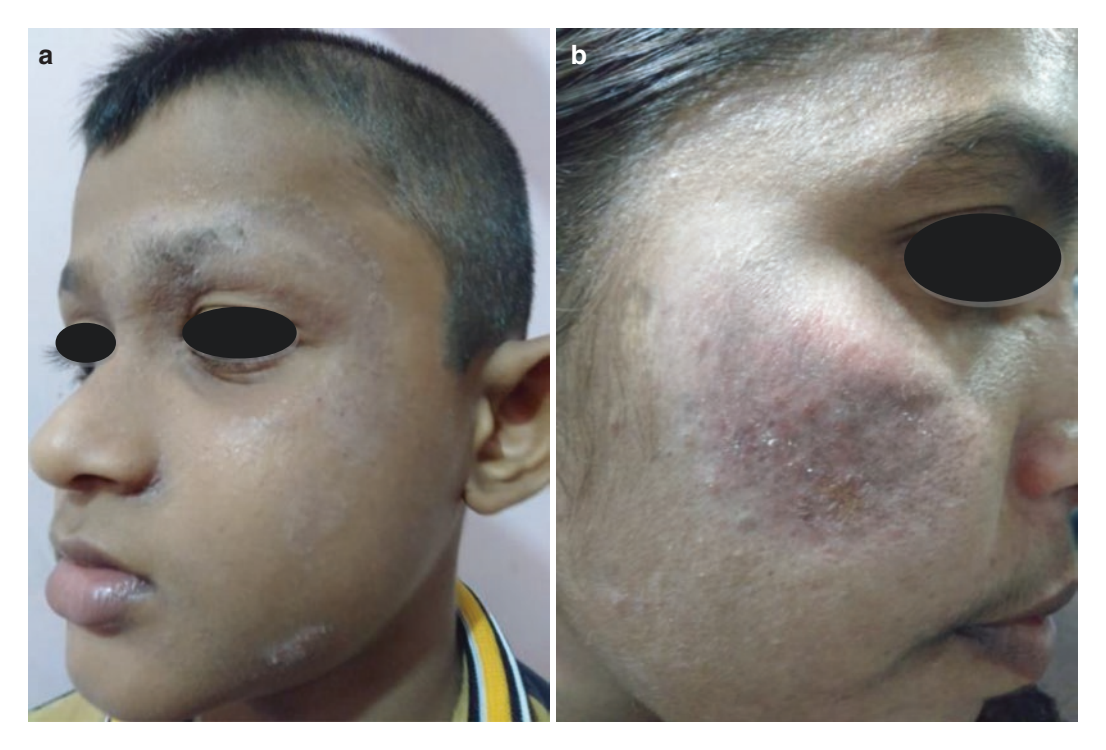
\textbf{Fig. 10.30} \hspace{0.2cm} \textbf{(a and b)} \hspace{0.2cm} \textbf{Photoaggravated dermatitis atopic eczema} \\