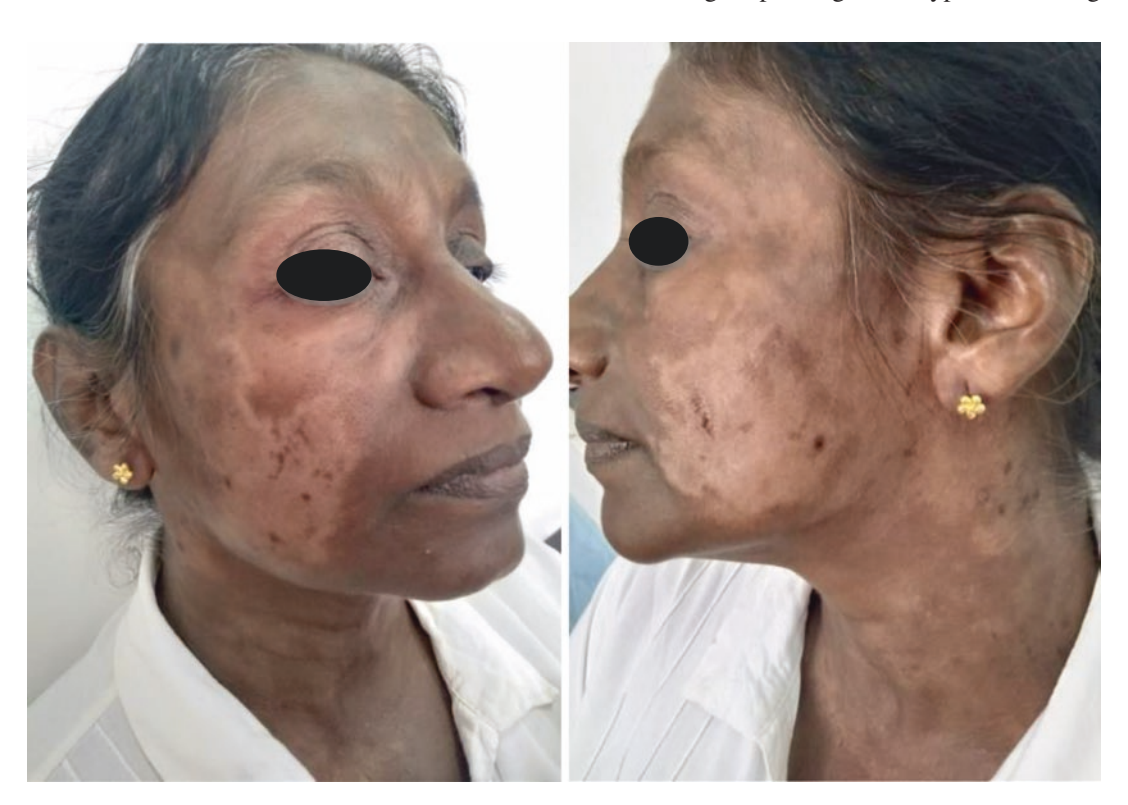
Fig. 10.21 Griseofulvin-induced photodermatitis

Naturally occurring chemicals from plants when come in contact with skin and are subsequently irritated by sunlight producing characteristic clinical features. Lesions are mainly distributed on face, V area on the neck, arms, and sometimes trunk and legs depending on the types of clothing