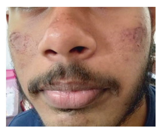
Fig. 10.40 Phytophotodermatitis induced by garlic applied on acne