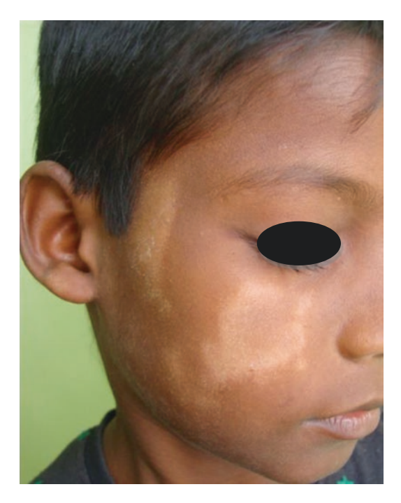
Fig. 10.2 Polymorphic light eruption (PLE) in an 8-year-old boy