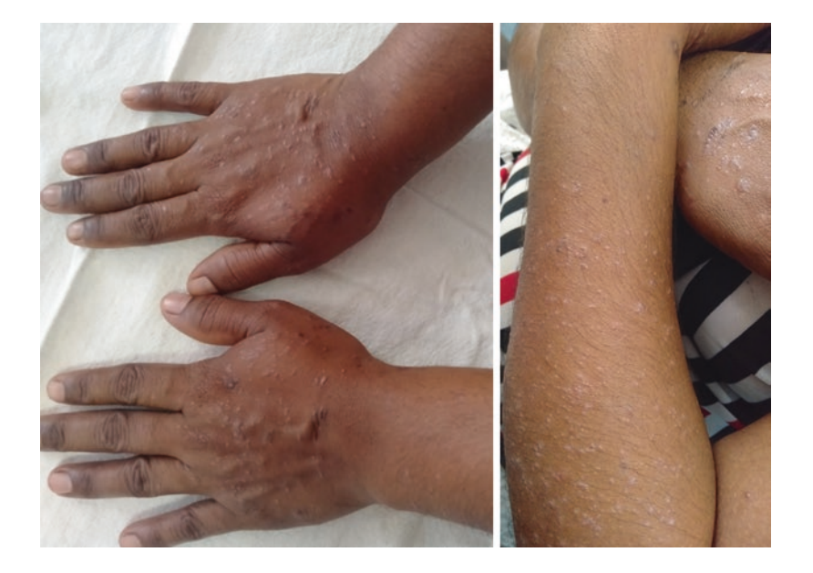
Fig. 10.22 Photoaggravated dermatitis lichen planus