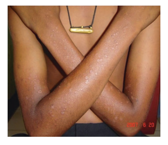
Fig. 10.11 Polymorphic light eruption. Showing skin eruption clearly demarcated to sun exposed areas (photographed by Dr. Ranthilaka R. Ranawaka)