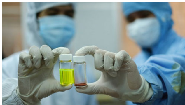
Fig. 2 The dye can emit photoluminescence by the UV exciting light

Cooperation (JCM-9) that took place in Ho Chi Minh City on December 2nd 2015, Vietnam is now ranked the 12th in the incidence (2.6/100,000) and death (1.0/100,000) about cancer diseases. Annually, there are nearly 125 thousand people who are diagnosed with the cancers in Vietnam. K Hospital opened two more additional campuses; and 3 campuses have totally 1540 beds. The number of patients coming for the cancer examinations in 2014 was 230,388 of which the number coming for the cancer treatments was 42,289.