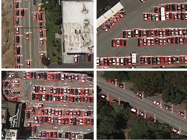
Fig. 2. Some detection results in San Francisco. The four images cover scenes from road with trees to parking lot

that proves the benefits of deep convolutional features and position regression. In Fig. 2, we give some detection results samples. The testing images cover scenes from road with many trees to parking lot. Our detector performs very well even vehicle objects are quite dense on parking pot or sheltered by trees.