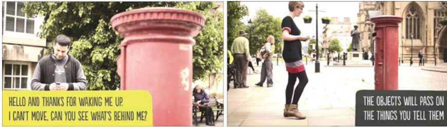
Fig. 2 Passers-by in Bristol communicating with a mail box

explore a smart urban environment with the aim of seeing where things go wrong and how this may lead to funny situations. However, of course, pranksters will try to make fun of others using digital technology, and we can expect that cyber-bullying and trolling will not only happen in social media and virtual game environments but will also be explored using sensors and actuators in the digitally enhanced world. Cheating, hacking, and modifying are other activities that will be exported from game environments to smart urban environments.