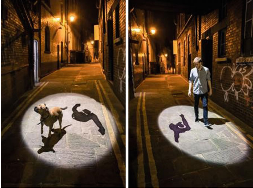
Fig. 3 Two examples of a lamp post casting shadows from its memory