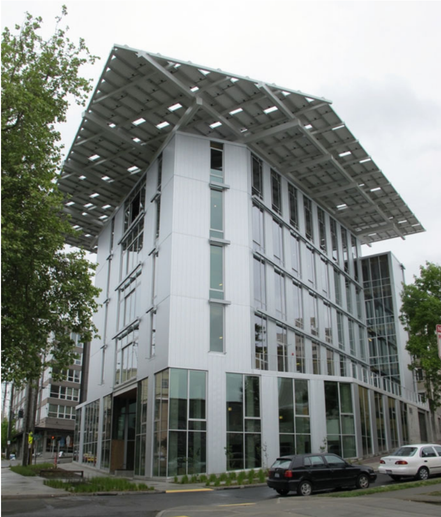
Fig. 11.1 Photo of the Bullitt Centre building

lighting that has automatic sensor-based control for dimming and on/off features based on occupancy and daylight. The elevators used have a regenerative drives system that makes them much more energy efficient. Plug loads for office equipment, such as computers, monitors, servers, printers, and copiers are limited to a maximum of 0.8 \text{ W/ft}^2 and further significantly reduced by using plug load occupancy sensors.