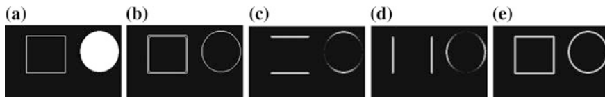
Fig. 1 Comparison chart for Different algorithms. a Original image, b Canny operator, c 0^\circ fixed direction filtering, d 90^\circ fixed direction filtering, e steerable filter

Image information features of each direction can be extracted based on principle steerable filter. Figure 1 is the result that the simple geometry are dealed after fixed direction filtering and steerable filtering. Among them, (a) is as the original image, (b) is for Canny operator, (c) is for 0^\circ fixed direction filtering, (d) is for 90^\circ fixed direction filtering, and the final picture (e) is filtered through a steerable filter. Although figure (b) after Canny operator treatment can identify image edge information greatly after, the square has appeared double edge. It makes a big deviation in the details. Obviously, the details and features will always be lost in a certain single direction, which is not beneficial to the analysis of the image, such as Figure (c) and (d). In contrast, (e) has almost no loss of detail after the steerable filter is. It shows all the edge features of the original image excellently. It can be seen from this experiment that the steerable filter has great advantages in edge detection.